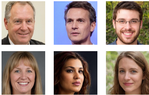
Figure 1. GAN-generated images

contains examples of GAN-generated images of human faces.