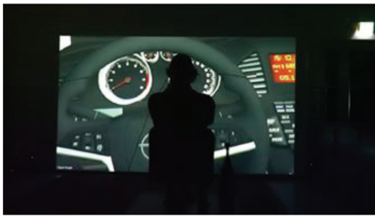
FIGURE 2: The VRE wall screen behind a participant.

The inspection task was chosen as it required participants to step out of the car, which hence entailed movement inside the VE. As with the discovery task, only the results of the first task block of each participant are discussed here.