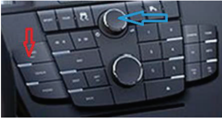
FIGURE 5: The radio used in the radio task. Red arrow points to the correct button for turning the radio on. Blue arrow shows where the participants tried first to start the radio.

the participants, as they are able to locate more objects in the environment.