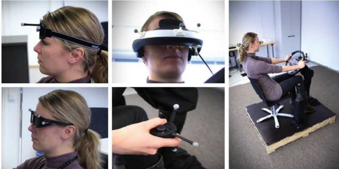
FIGURE 1: The devices used in the experiment: upper left: headband; lower left: 3D glasses; upper centre: head-mounted display (HMD); lower centre: the controller; right: car skeleton.