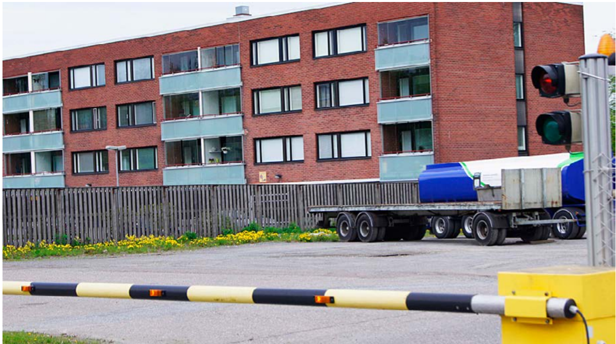
Fig. 1. A wooden fence separates an industrial area from a housing area. Research photograph for the experimental artistic intervention Oars for a Fence , 2016, Aittaluoto, Pori.