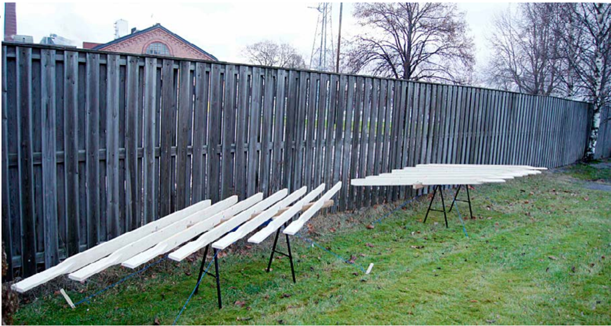
Fig. 4. Denise Ziegler, Oars for a Fence (2016), experimental artistic intervention, Aittaluoto, Pori. A temporary work in public space: next to a fence two sets of stylised oars are placed pointing in two opposite directions, according to the two positions of oars between a rowing movement.

Previously, there was a passageway here to the cardboard factory, and there were even railway tracks passing through the street to the factory. In the 1970s the railway tracks were dismantled and the factory area was separated from a newly-built housing area with a light chain-link fence. This fence has later been replaced by the heavy wooden fence that is there today. The fence was built most probably by the Rosenlew company; at present the property is owned by UPM Biofore.