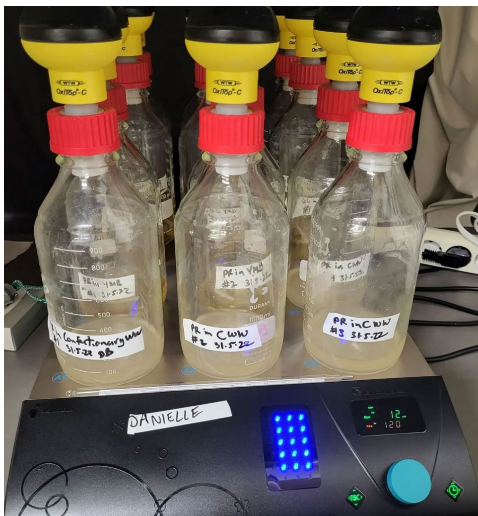
Fig. 1 Oxygen uptake measurements using the OxiTop system

Oxygen uptake was measured using a manometric respirometer (OxiTop Control 12 system, WTW, Xylem Analytics, Germany) (Fig. 1), as a non-invasive determinant of metabolic activity in the cells [23, 24]. Each species was grown in batch cultures for 1–2 weeks and their oxygen uptake was continuously (56 min intervals) measured. Experiments were set up using aseptic techniques as follows: 0.5 mL ( 0.5\text{ g DW (Dry Weight) L}^{-1} ) of culture