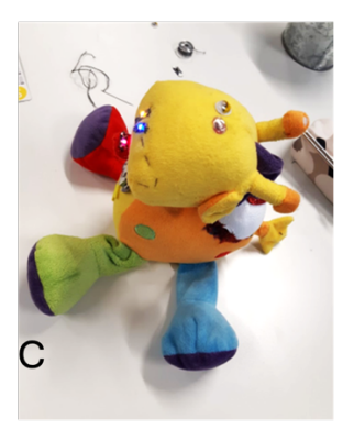
Figure 4: Future technologies as imagined by participants in India and Finland. (a) Children's imagined future robots that can teach and help with household chores. (b) Children imagined this robot would assist with domestic labour such as caregiving and housework.

who could afford this. This suggests valuing both empowerment through education and equitable access to education.