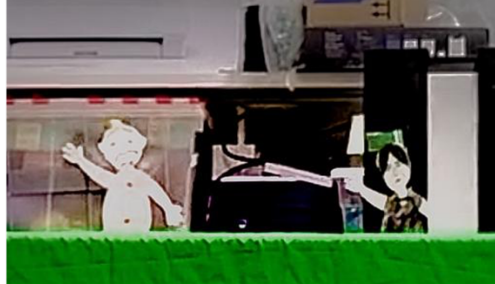
Figure 3: (left) In Workshop #3, children performing their solution of a robot which would increase empathy between pupils using "empathy stamps". (right) In Workshop #4, children performing their imagined future with an AI-enabled implanted brain chip.

Activities: In groups of 2-3, we asked children to imagine a "big idea" for changing the future of their school. Each group developed their own idea. We asked them to imagine what people might say in support of or against the idea, and to imagine a character who has an opinion about this idea. We introduced examples of AI in everyday life, such as YouTube recommendations, Google search results ranking, social media feeds, and voice assistants. We introduced ChatGPT and participants used a template to prompt ChatGPT to generate a script in which their characters debated their big idea. Participants created physical paper-and-rod puppets for their characters. We printed out the scripts and participants modified the scripts as they wished. Participants performed the scripts (Figure 3) and then discussed and critically reflected on their envisioned futures. Note, no ChatGPT-generated text is included in data for analysis or included in this paper, because our analytical focus is on how children imagined futures and critically considered societal and ethical impacts of those futures.