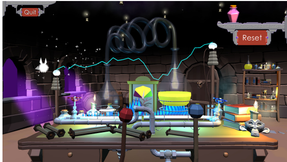
FIGURE 2. QWiz VR environment.

MiTale and the Turku Quantum Technology (TQT) research group at the University of Turku. 3,18 VR technology seamlessly integrates players as active participants in the digital realm, with spatial interactions closely mirroring those of the real world. This functionality allows for the direct manipulation of surroundings, faithfully replicating immediate consequences for actions.