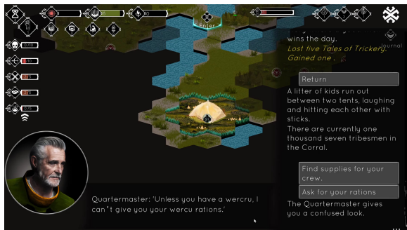
FIGURE 1. Screenshot from the game “C.L.A.Y.—The Last Redemption, the use of Qiskit in map/exploration mode.

ourselves at the nexus of research and practical application. The collaborative spirit among research groups is palpable, with diverse approaches converging under the umbrella of quantum software development. The following sections unfold against the backdrop of this dynamic synergy, as we explore the various methodologies that have surfaced through ongoing research and market-driven projects.