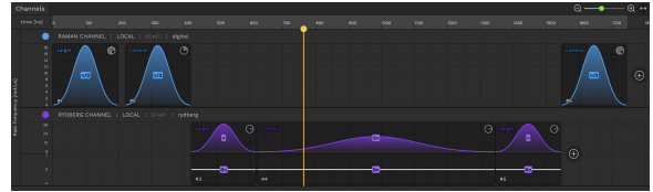
FIGURE 3. Channels feature from the Pulser Studio by Pasqal, used to design pulse sequences. Control-Z Gate example.

that the design obstacles are similar to those in the development of GUIs for quantum games.