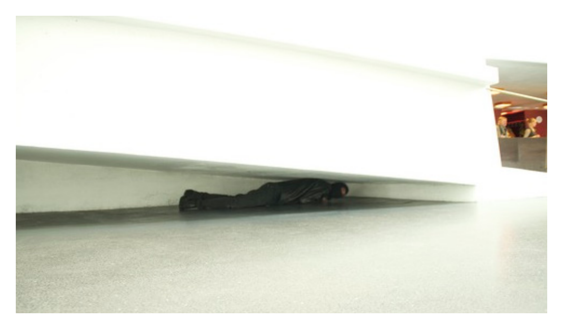
Image 1. Becoming-Imperceptible. Non-authorized performance in Kiasma Museum of Contemporary Art. Helsinki, 2011. <sup>1</sup>