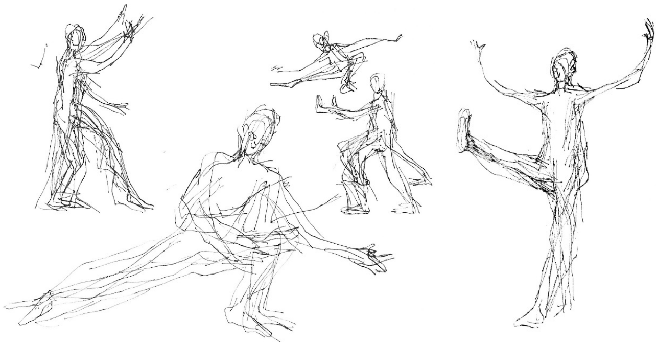
Figure 1. How to capture visually the sense of the continuous, flowing movement of the “internal discipline” of taiji? Image by Marja Rastas.