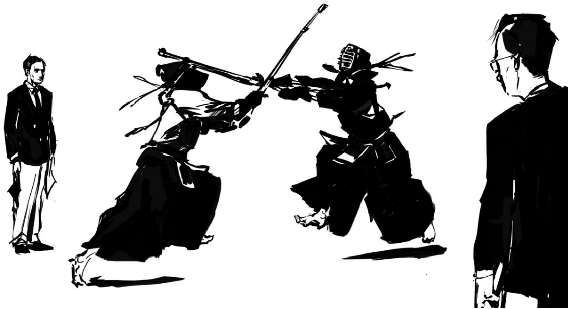
Figure 4. The competitors and the referees form a magic circle of play during a kendō match.

Competing in a match is one way of practicing and learning martial arts. My martial art, kendō, is a modern version of ancient Japanese sword fighting. I have done competitive kendō for ten years and participated in European and world championships.