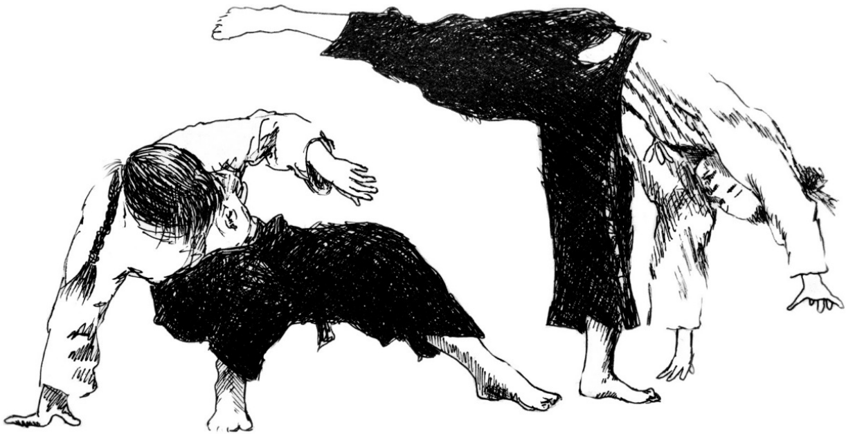
Figure 2. Responsively following the movements of the opponent is significant in a taidō match.

Learning a skill in Japanese martial arts is traditionally described as consisting of three stages: shu , ha , and ri (Chiba, 1989; Klemola, 2004). The previous section discussed the experience of a beginner, shu . I will address my journey to the level of the advanced student, ha .