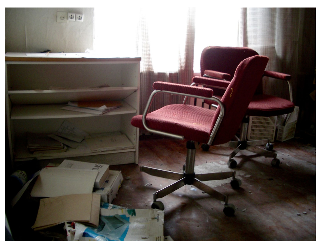
Fig. 4: The state of the place when they broke in 2. Denés Farkas 2006.