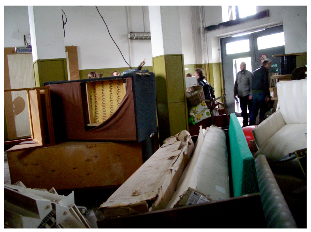
Fig. 3: The state of the place when they broke in. Denés Farkas 2006.