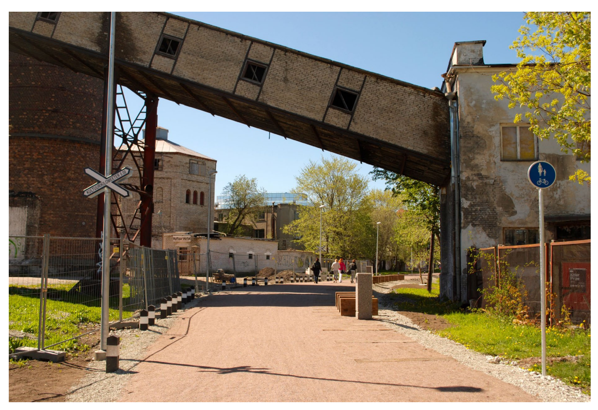
Fig. 2: Quasi-street of the Cultural Kilometre / Kalaranna. T. Pikner, 2011.

Kilometre crossed a number of privately owned areas, however, meaning that public use and open access had a temporary character from the beginning. This promenade was very popular and highly frequented between 2011 and 2014, and many of the locals commented on the correlated improvement of the life-quality, acknowledging the positive impact of the path for the public interest.