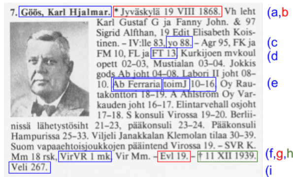
Fig. 2. A biographical entry in the register book with examples of extracted data fields.