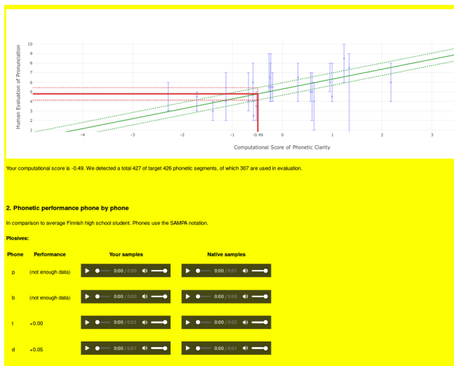
Figure 2: A general goodness of pronunciation score is given in the chart, which maps computer scores to human rater scores. Individual phoneme scores are also presented.