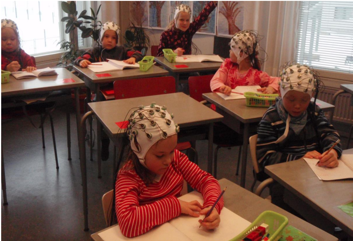
Figure 1: Finnish school children participating in a neuroscientific experiment (mobile EEG) in their natural environment at school.

approaches to the making process and its products.