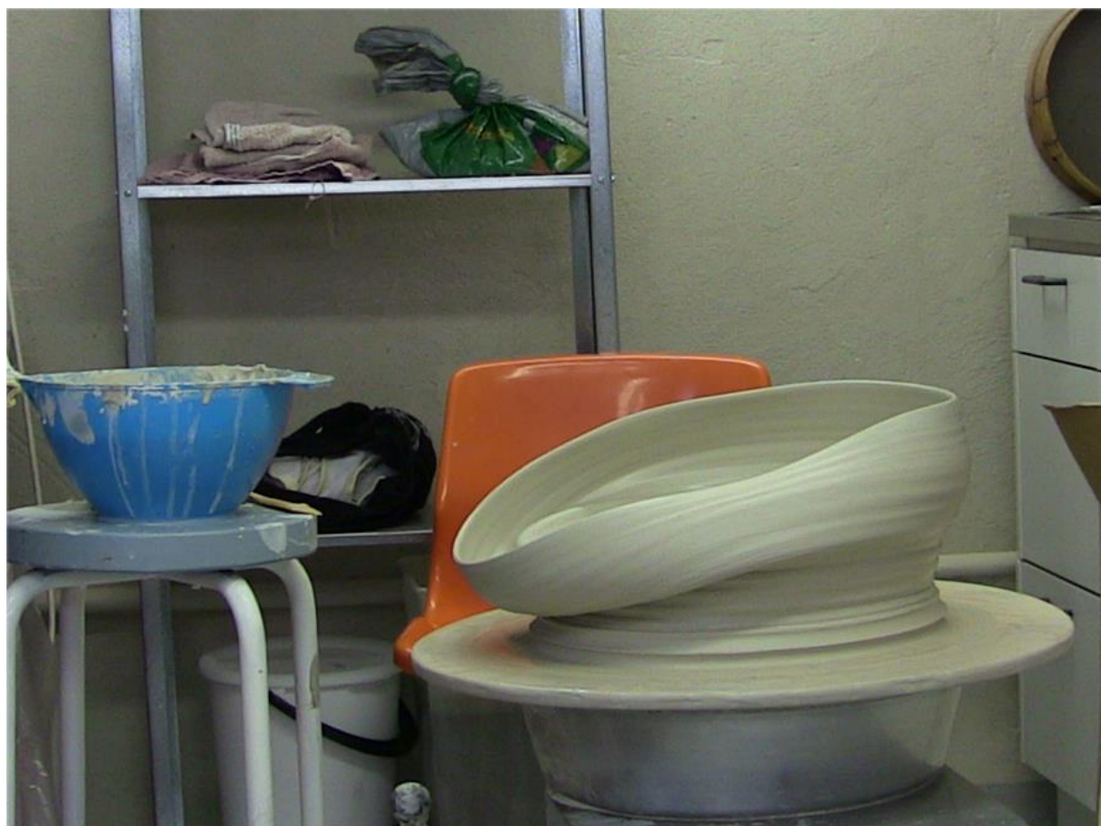
Figure 4: The results of a failed attempt to throw a clay bowl on a potter's wheel.

While arts and crafts can be practised alone, in educational and therapeutic situations the making process is interwoven with social interaction, in which emotions also play a crucial part. Dissanayake (2009, 158) claims that artistic behaviour assists the managing of difficult emotions in circumstances of uncertainty. In the context of art and design education, when young adults are still uncertain about their personal and professional identities, art and craft making has enabled students to ponder on these issues (Figure 5) and served as a method of finding their own way to proceed in their creative practice (Mäkelä & Löytönen 2017, 11–12).