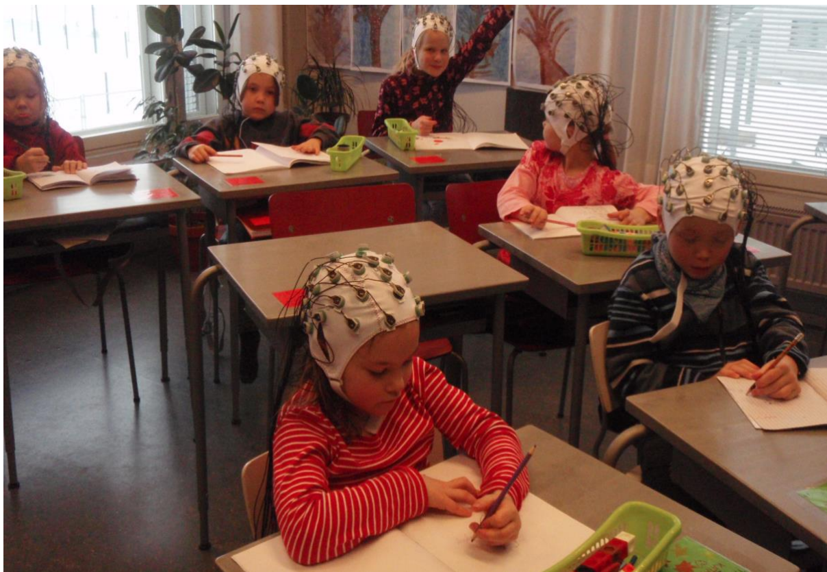
Figure 1: Finnish school children participating in a neuroscientific experiment (mobile EEG) in their natural environment at school.

approaches to the making process and its products.