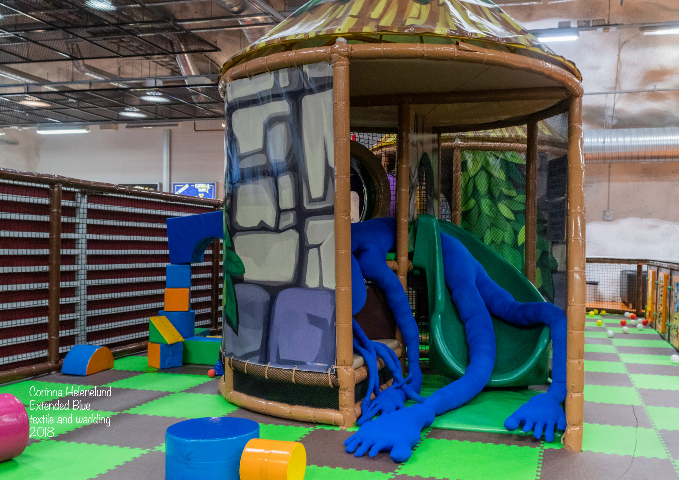
Corinna Helenelund Extended Blue textile and wadding 2018