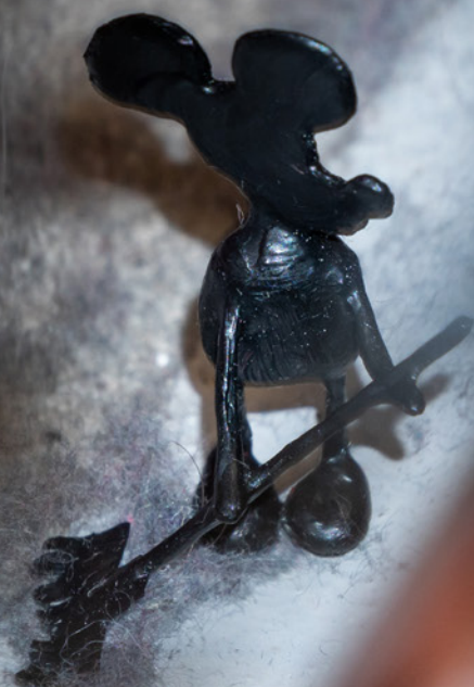
LM Salling Day Job or Mickey With Broom metal wire, tape, wax, wood glue, acrylic paint ca. 2cm x 2,5cm x 4cm 2017