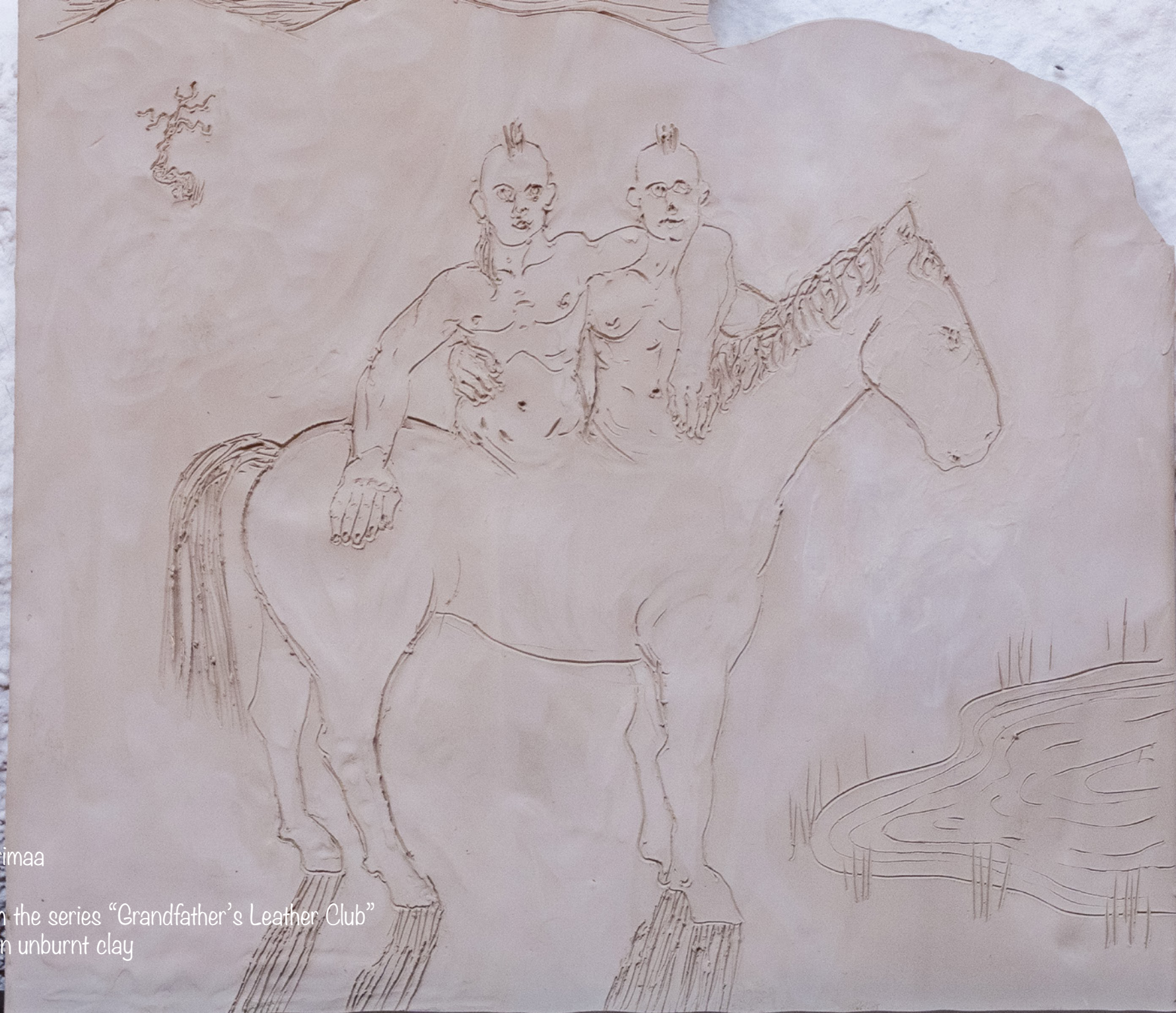
Arttu Merimaa (Untitled) work from the series "Grandfather's Leather Club" drawing on unburnt clay 2017