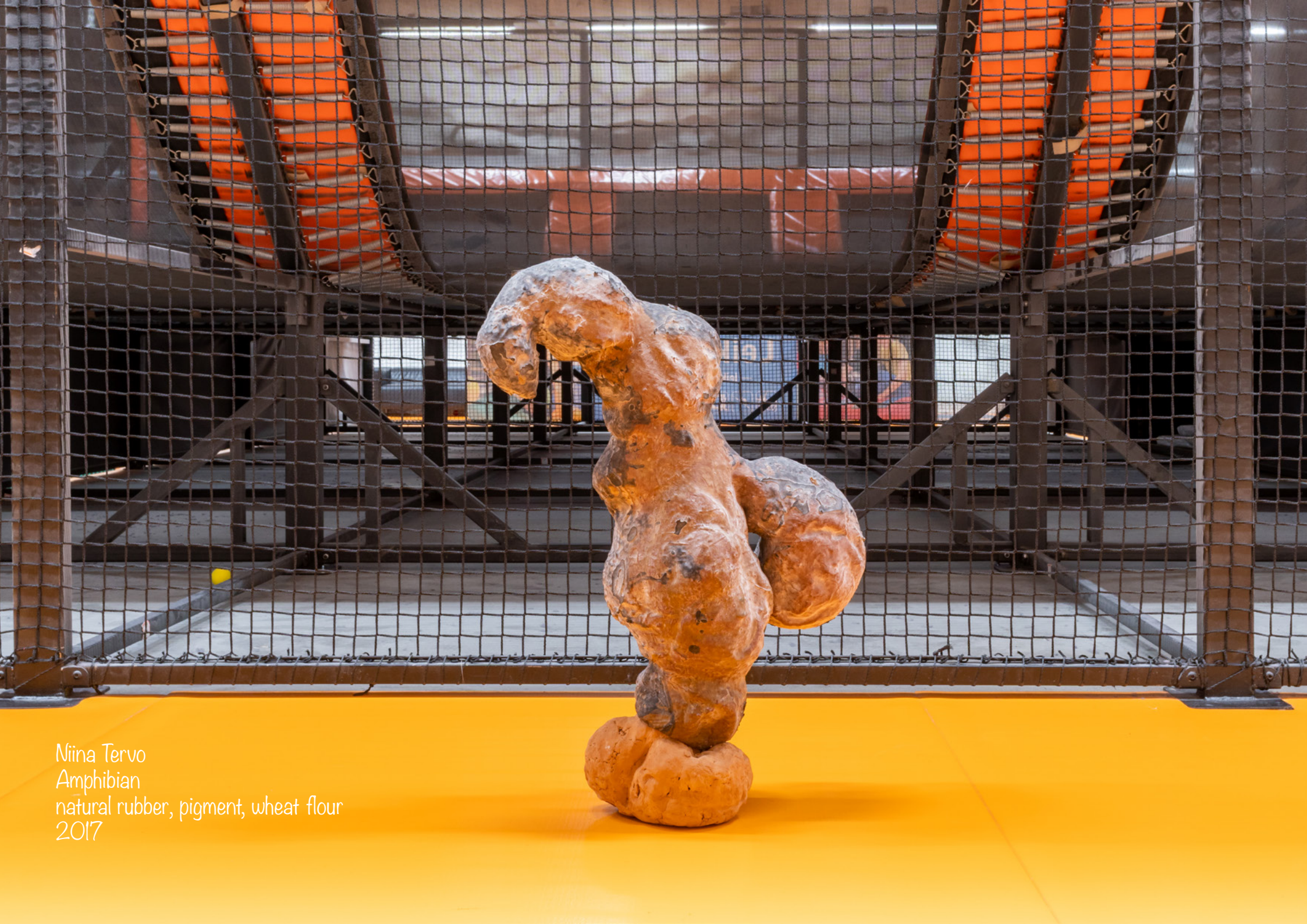
Niina Tervo Amphibian natural rubber, pigment, wheat flour 2017