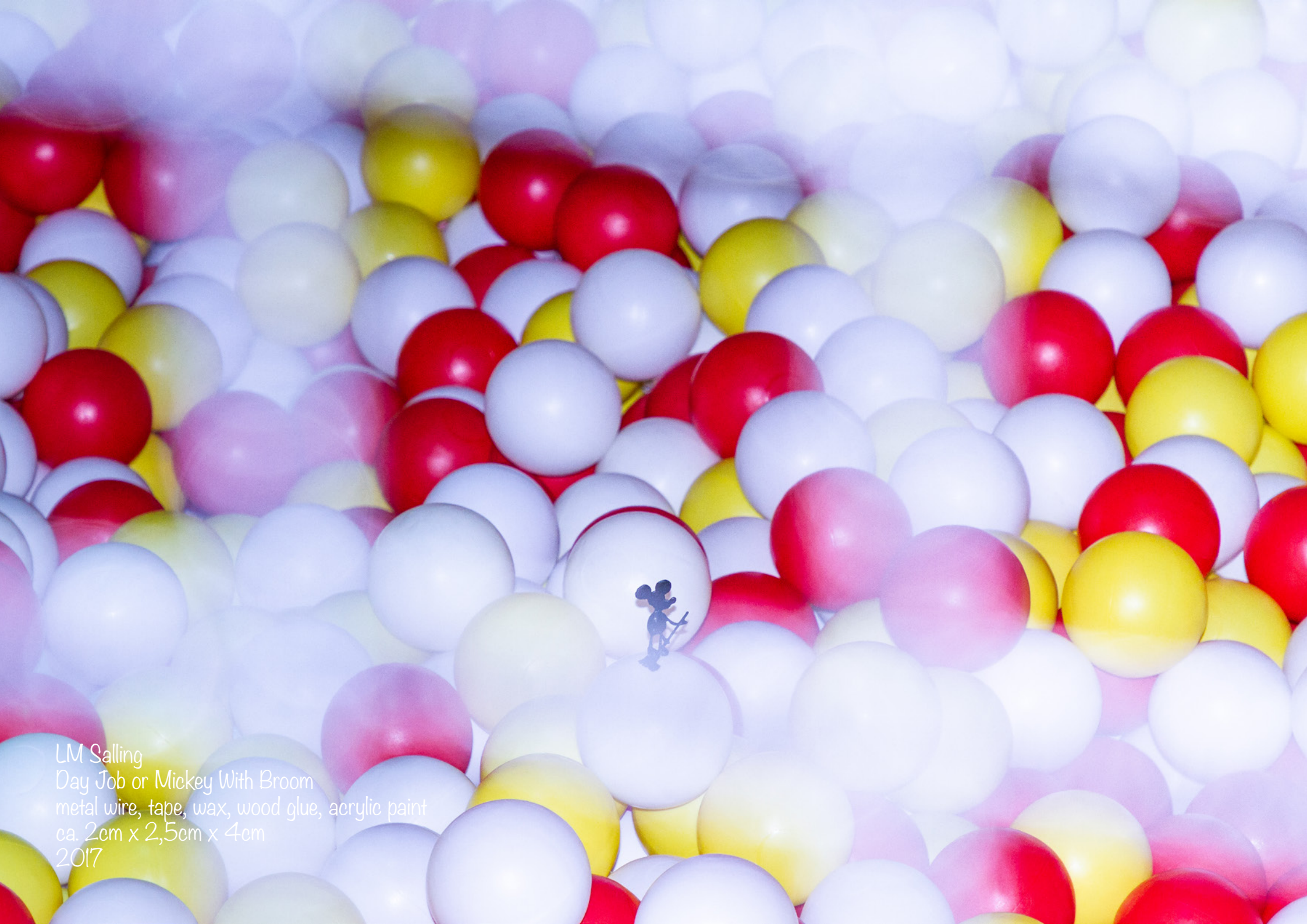
LM Salling Day Job or Mickey With Broom metal wire, tape, wax, wood glue, acrylic paint ca. 2cm x 2,5cm x 4cm 2017