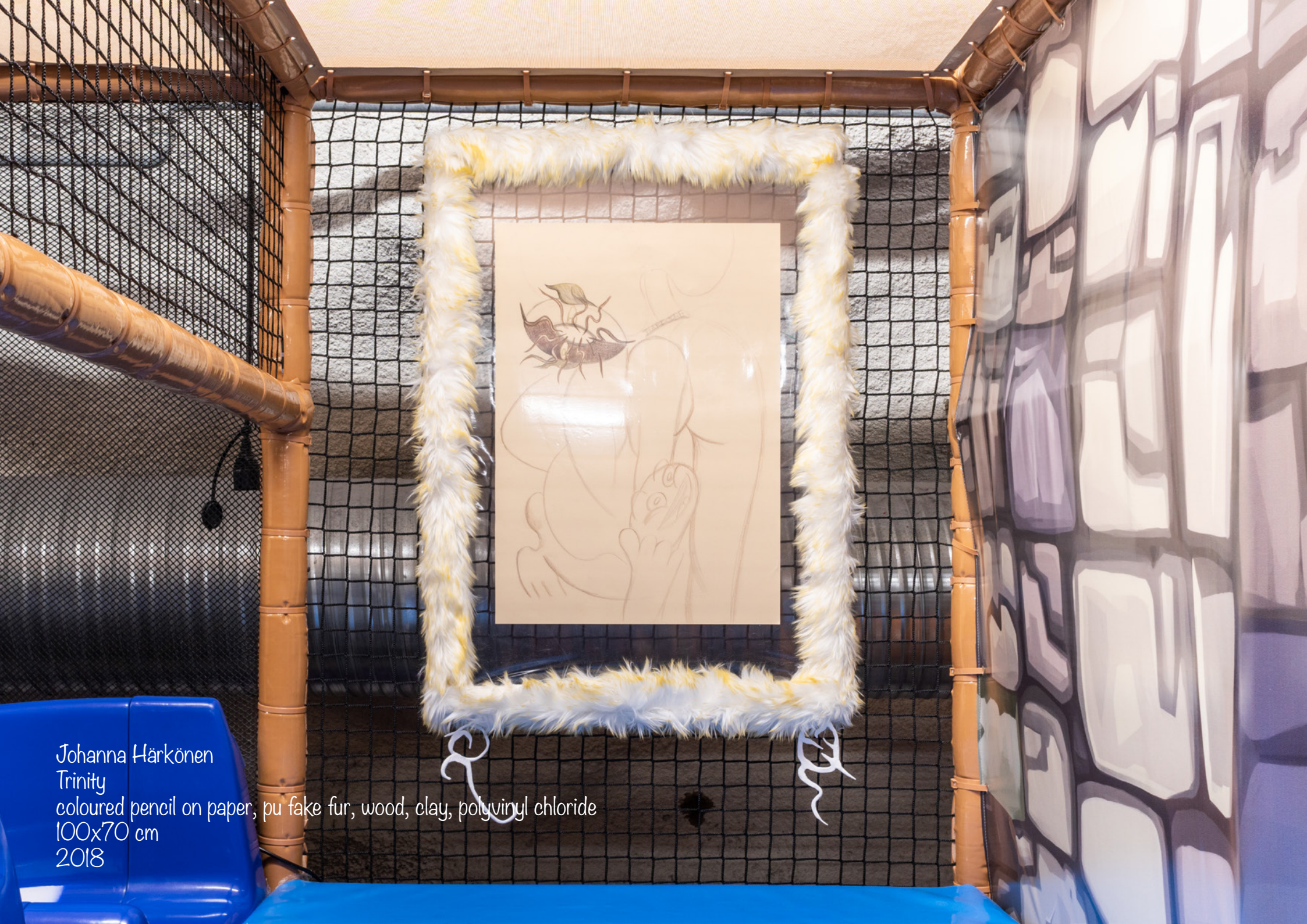
Johanna Härkönen Trinity coloured pencil on paper, pu fake fur, wood, clay, polyvinyl chloride 100x70 cm 2018