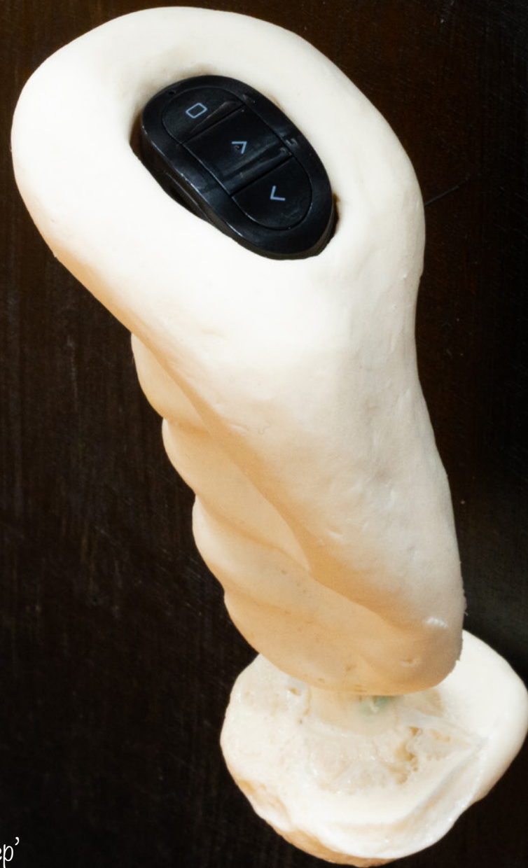
Lukas Hoffmann Untitled Remote Control as part of '2 2civilcourage makes me weep' foam cast with remote control, slide show, size and duration variable 2018