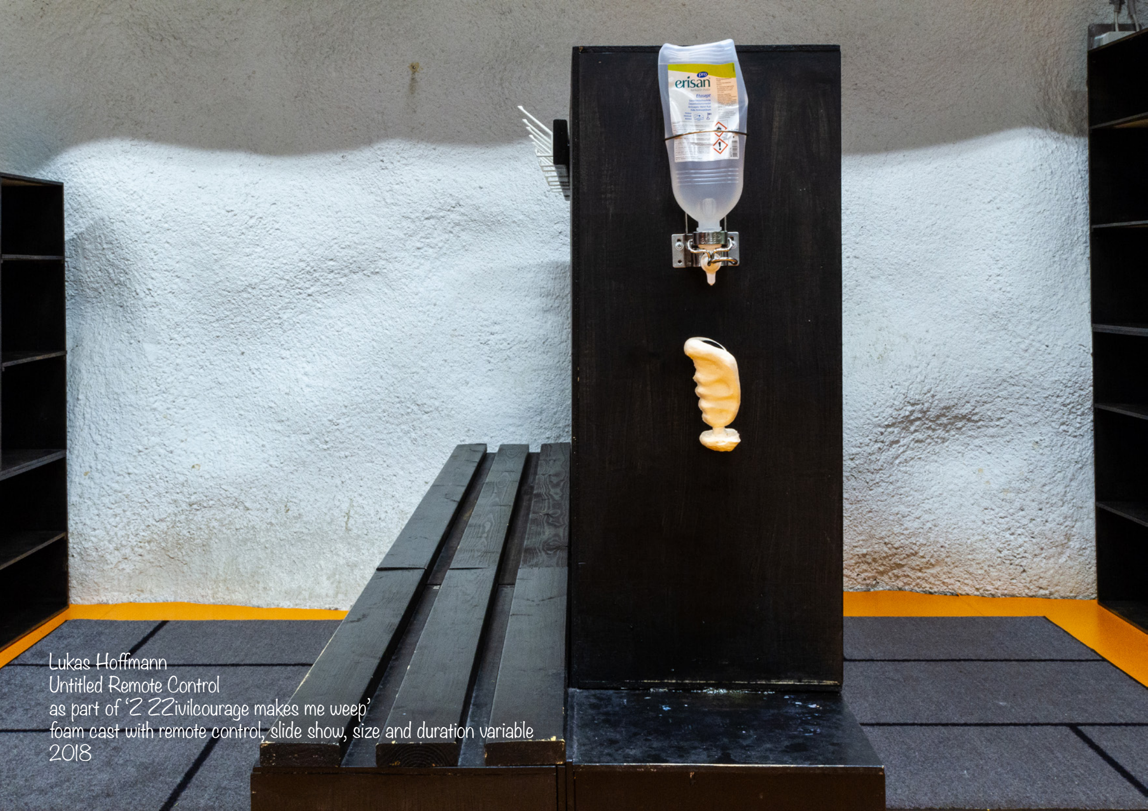
Lukas Hoffmann Untitled Remote Control as part of '2 2civilcourage makes me weep' foam cast with remote control, slide show, size and duration variable 2018