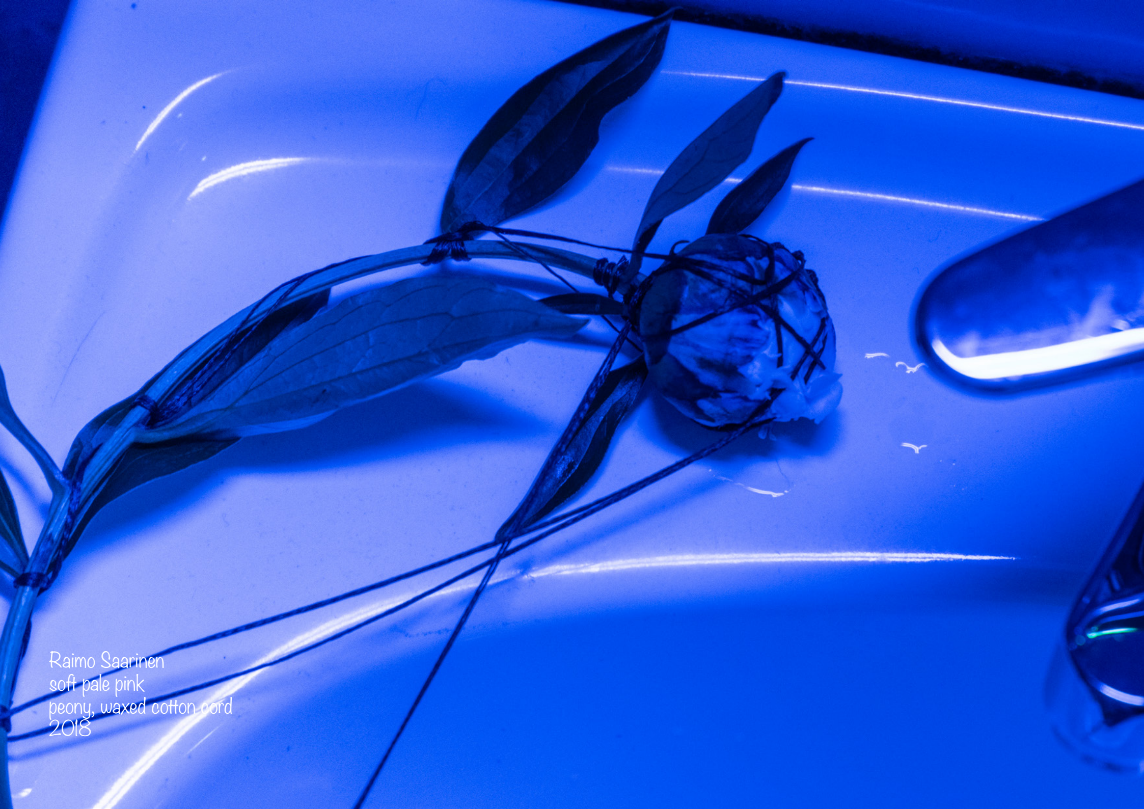
Raimo Saarinen soft pale pink peony, waxed cotton cord 2018