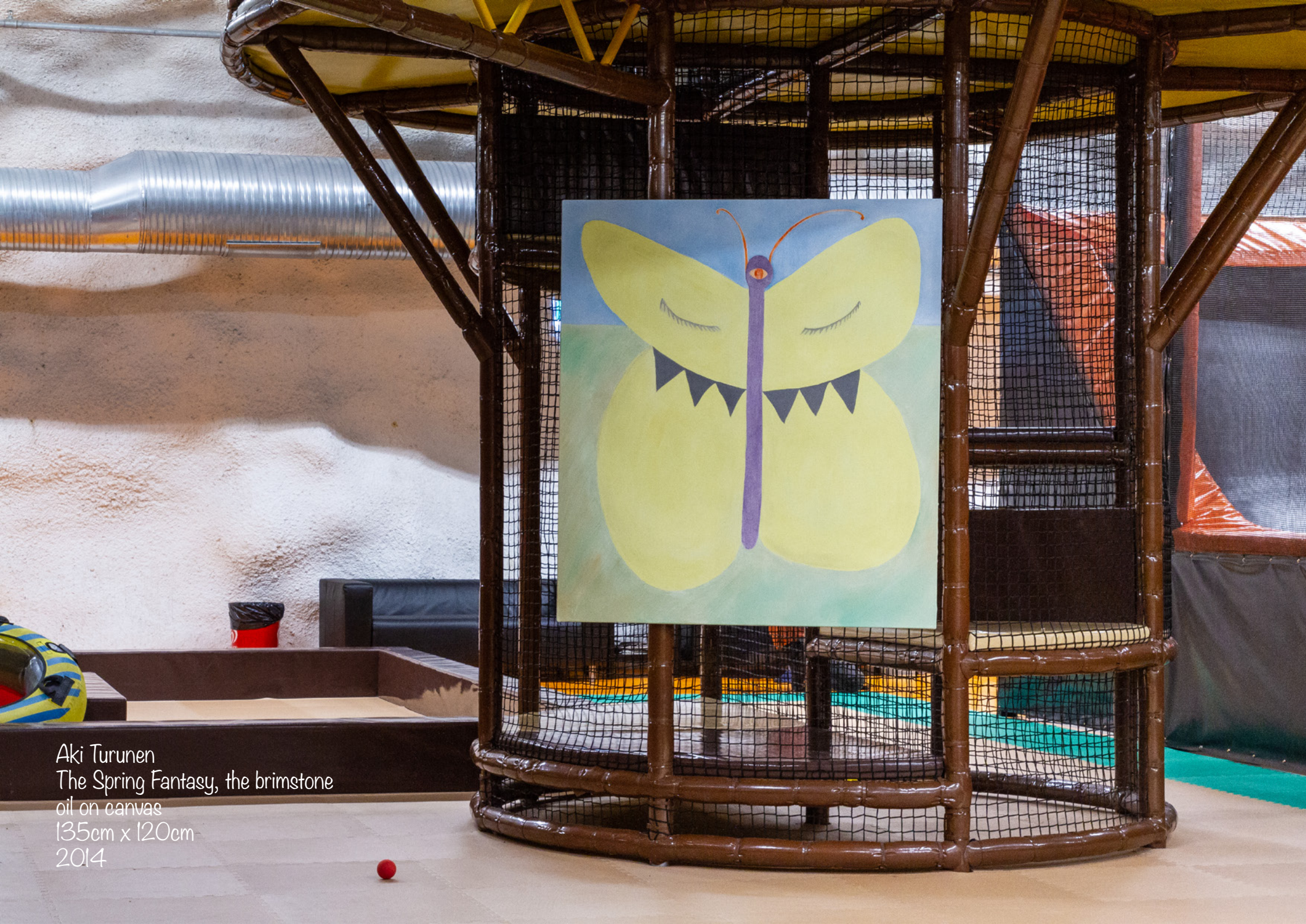
Aki Turunen The Spring Fantasy, the brimstone oil on canvas 135cm x 120cm 2014