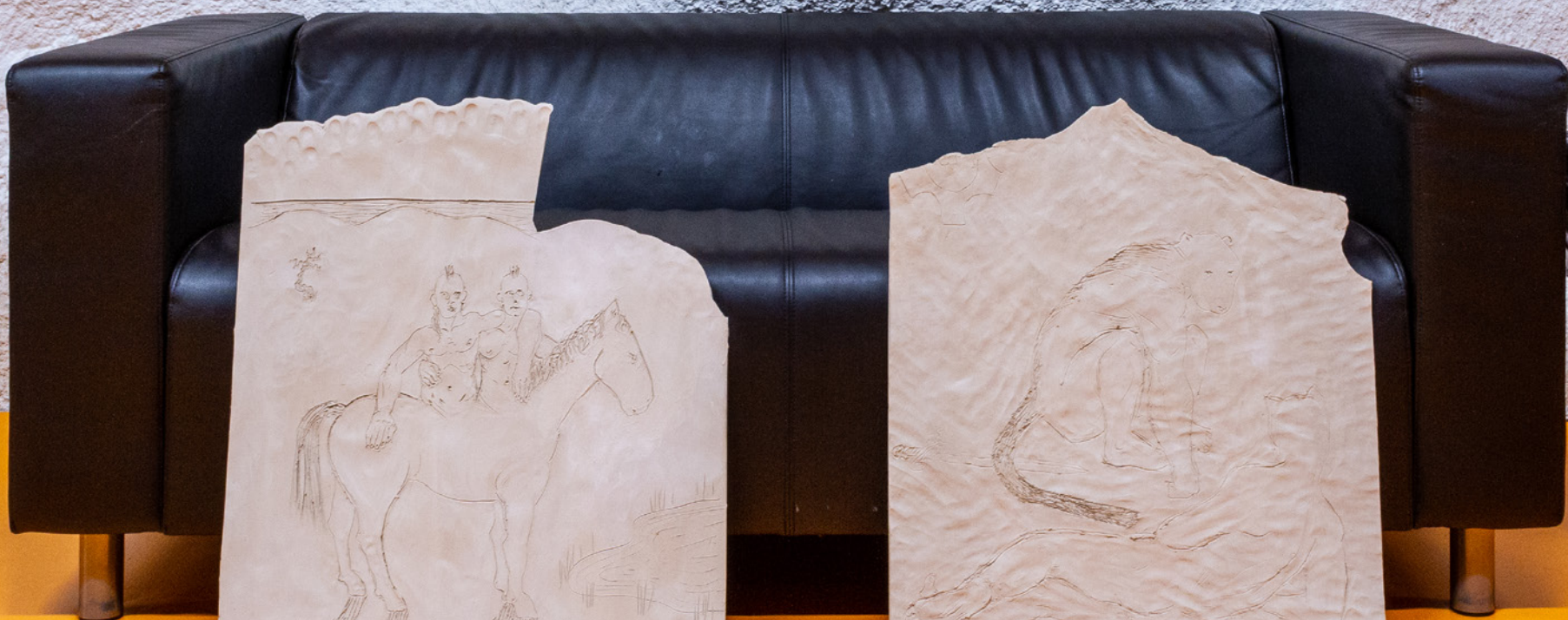
Arttu Merimaa (Untitled) work from the series "Grandfather's Leather Club" drawing on unburnt clay 2017