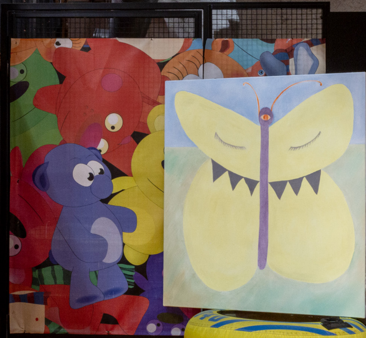
Aki Turunen The Spring Fantasy, the brimstone oil on canvas 135cm x 120cm 2014