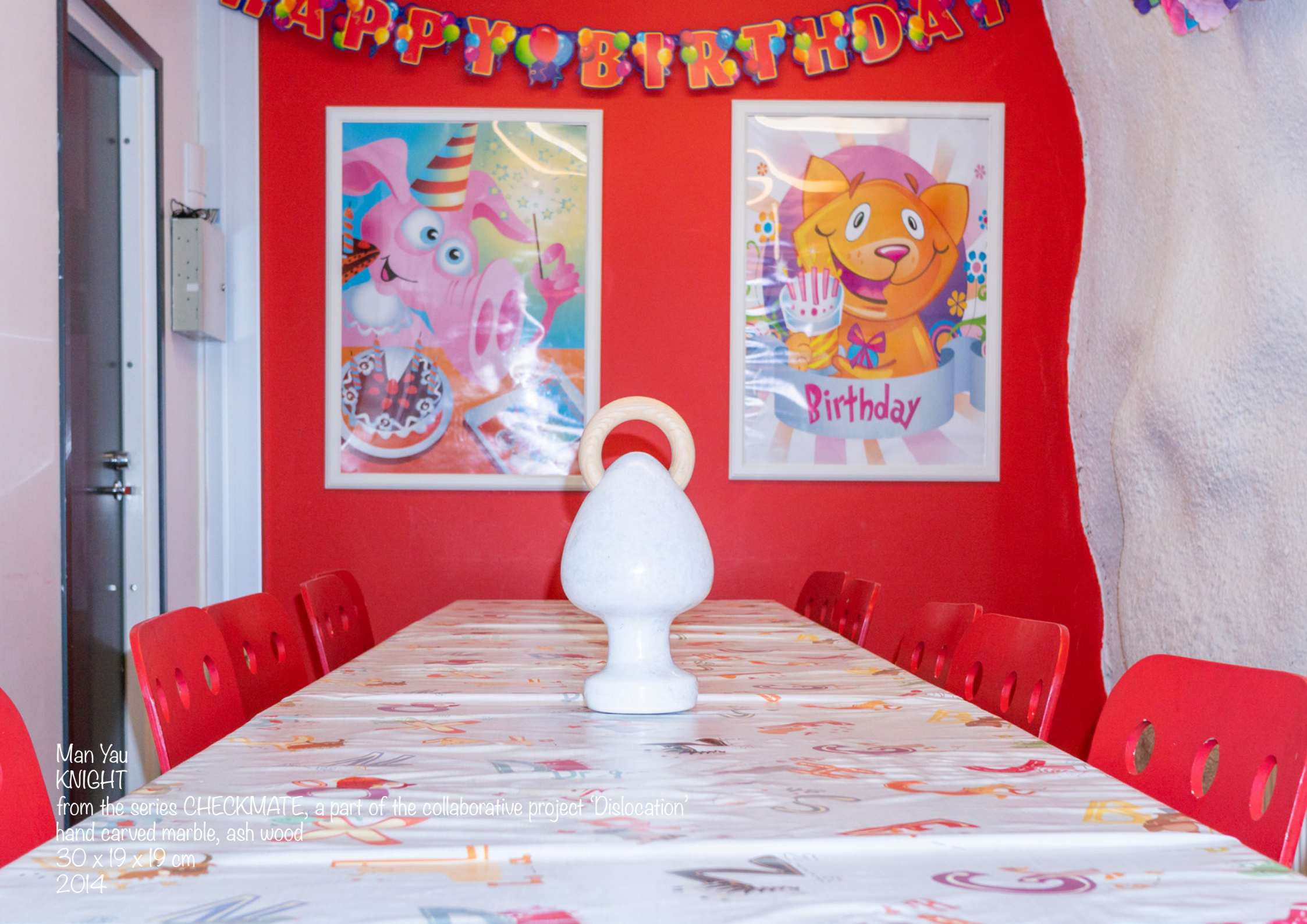
Man Yau KNIGHT from the series CHECKMATE, a part of the collaborative project 'Dislocation' hand carved marble, ash wood 30 x 19 x 19 cm 2014