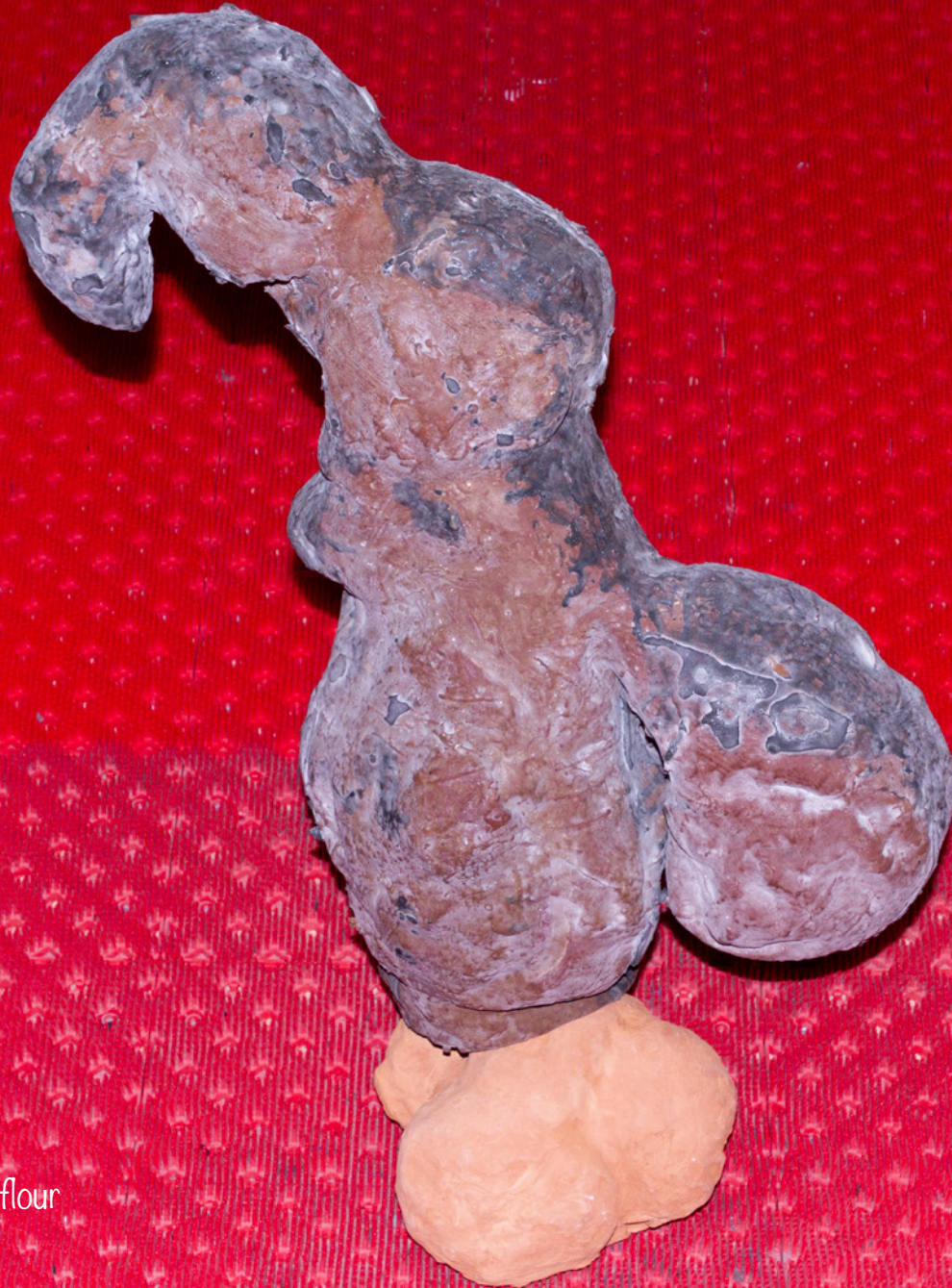
Niina Tervo Amphibian natural rubber, pigment, wheat flour 2017