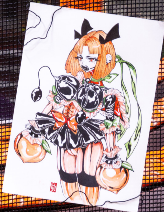
Milena Huhta Peach Sissy work from the series "FetiShōjo" ink and watercolour on paper 2018