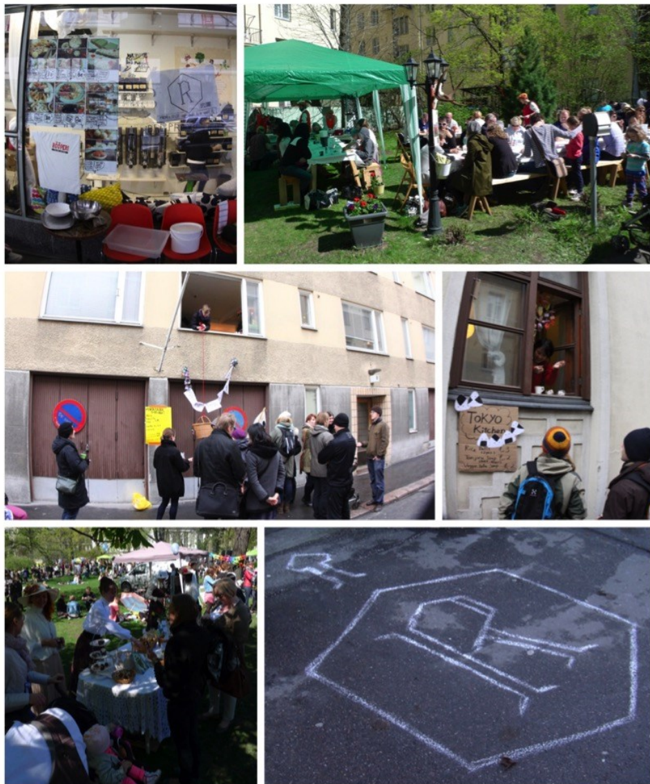
FIGURE 3: EXAMPLES OF SPATIAL APPROPRIATION AT RESTAURANT DAY

NOTE. — First row: Manny's Indonesian restaurant in front of a friend's café (left); use of apartment building courtyard and furniture (right). Second row: Conducting transactions through apartment windows (left and right); Third row: Russian tea café with vintage dresses at Plague Park (left); guiding patrons with chalk Restaurant Day logo on pavement (right).