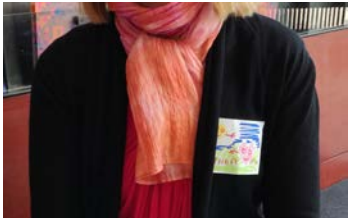
Figure 1: A participant wearing the personal sticker.