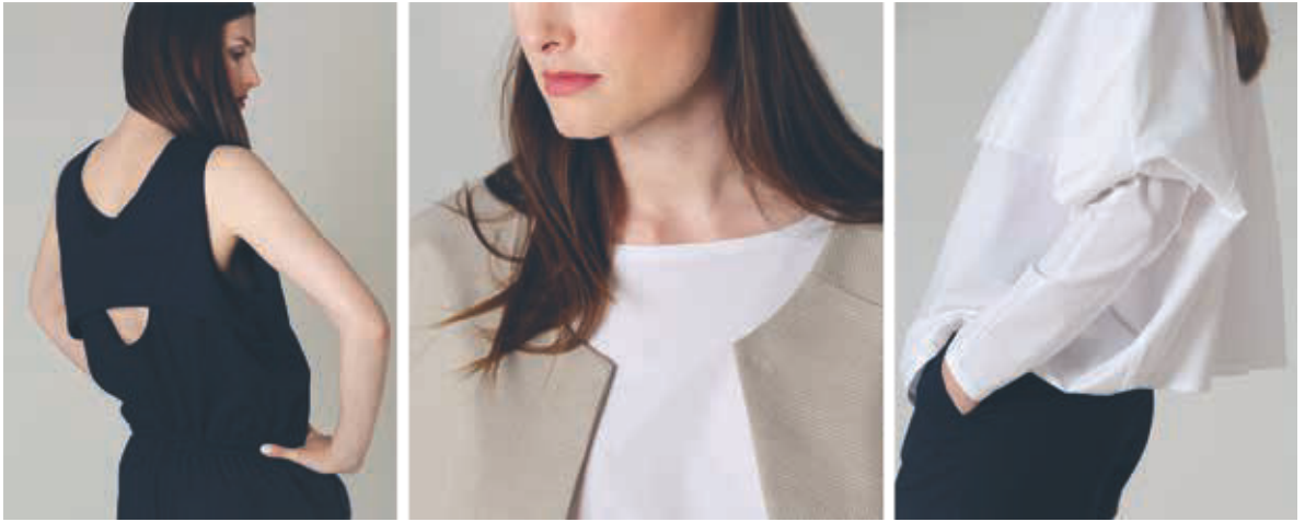
Figure 4. 'Curated circularity – designed for Infinity' collection for JAN 'N JUNE.

Due to insufficient legislation, companies are left largely free to decide about their own sustainable practices (Hvass 2016). Hence, real-life cases are crucial for proliferation of sustainable practices, because they hold the potential to embody a proof-of-concept that can later encourage and motivate other stakeholders to take action. Ideally, companies also open their processes aiming for sustainability to other actors in the industry, as in the case of circular.fashion . Openness and sharing information are fundamental in order to further accelerate the transition towards CE. However, Hvass (2016) mentions a tendency of companies to develop sustainable solutions only for themselves. Yet, patenting has not (to the author's knowledge) been mentioned as a critical aspect in previous literature. Budde (29.01.2018) mentions patenting as a major concern potentially delaying material circularity. The following notion illustrates the approach of circular.fashion related to open source thinking: