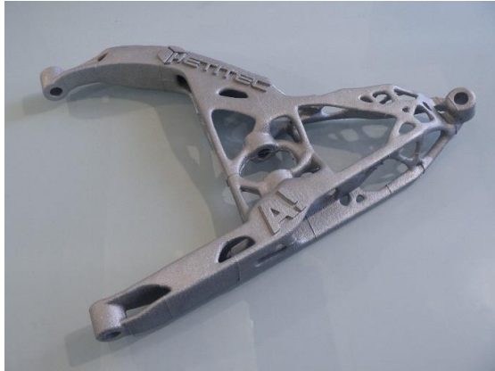
Fig. 4. Final cast a-arm

For the A-arm, the process required a negative geometry, a mould cavity to be designed for sand printing. To substantiate the claim that parting lines and other basic casting design viewpoints are not as important as in a traditional process, the cavity geometry was simply split in multiple parts. The heavy splitting mostly helps in cleaning unbound sand from complex cavities. Fig. 3. illustrates the used multi-part mould assembly. The final component size was roughly 60x40x10 cm (LxWxH). Fig. 4. shows the cast component.