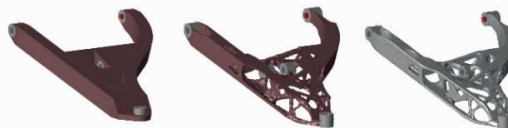
Fig. 2. A-arm design space, raw data and smoothed geometry

Investment casting methods lend themselves nicely to the production of intricate shapes, as the process is based on lost patterns. 3D printable waxes and plastics are easily integrated into contemporary industrial processes without the need for major changes. Fig. 1. shows process stages of a hypothetical propeller hub geometry optimization and design to be produced with investment casting. In this case, the nature of the process meant that the final design was to be a positive shape. The final 3-part design was 3D printed in wax and used as a pattern in conventional investment casting process and cast in aluminium.