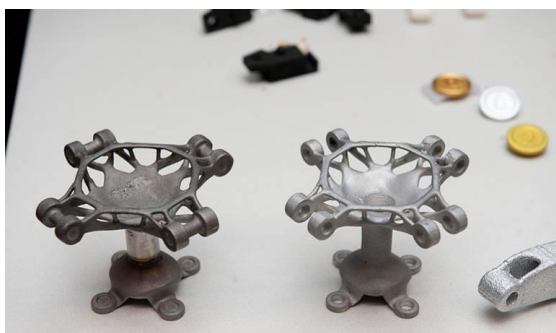
Fig. 5. Multi-part assembly pictured on the left and a straight cast design shown on the right

If a pick-the-best-of-everything style of design thinking is taken into the extreme, additional possibilities come into play. Mixing and matching materials produced with different processes is possible. Demonstrating this approach, the propeller hub geometry was reused. The more intricate top part was 3D printed in wax, and investment cast, the middle shaft machined, and the base additively manufactured with laser sintering. These separate parts were made in stainless steel, namely AISI 316, and later laser welded to complete the assembly. The resulting component is shown in Fig. 5.