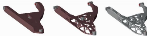
Fig. 2. A-arm design space, raw data and smoothed geometry

Investment casting methods lend themselves nicely to the production of intricate shapes, as the process is based on lost patterns. 3D printable waxes and plastics are easily integrated into contemporary industrial processes without the need for major changes. Fig. 1. shows process stages of a hypothetical propeller hub geometry optimization and design to be produced with investment casting. In this case, the nature of the process meant that the final design was to be a positive shape. The final 3-part design was 3D printed in wax and used as a pattern in conventional investment casting process and cast in aluminium.