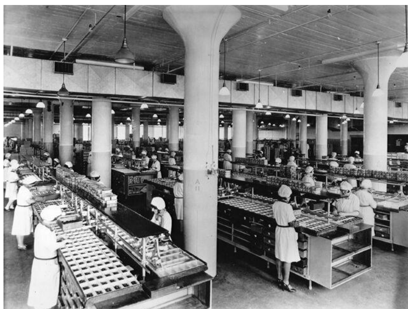
Figure 2. Factories were among the first to adopt modern air conditioning. Image & Source: Willis Carrier (fair use)

or even 10%, causing huge fluctuations that resulted in damage to collections (Brown & Rose, 1996).