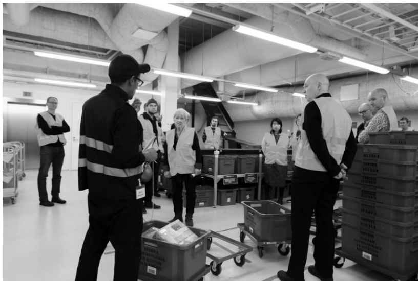
Fig. 4. The study of thermocultures serves as a foundation for experimental art works such as the author's Memory Machines performative tour project that explored the thermal infrastructures of the Helsinki Central Library in 2019.

include museum managers, curators, engineers and architects. The process of temperature and humidity manipulation cannot simply be left to technicians and engineers. Perhaps thus we could move from designing generalized climate control systems to ones aimed at cultural heritage management. By doing so, we might be able to regulate and customize relative humidity and temperature settings to particular contexts. Experimenting with new thermal protocols, guided by assessments from an environmental perspective, and even further study of degradation would entail a variety of novel interventions. The study of thermocultures of memory would thus provide a common platform for temperature and humidity, cultural heritage and mediation. It also would stimulate a discussion of the energy infrastructure, environmental impacts and ecological responsibilities. Finally, this may allow us to introduce a new regime of thermocultures for memory institutions and perhaps help to reduce energy consumption and carbon footprints.