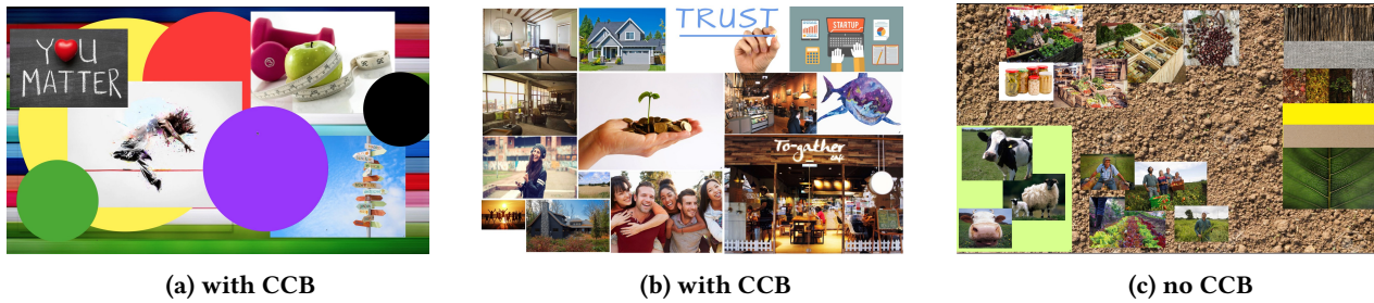
Figure 4: Example mood boards designed in the study with the support of a CCB (a and b) and without (c).

In contrast, the effect of AI on HQ-S resulted mostly from an effect on Novelty ( F(1, 15) = 5.84, p < .05 ; with-AI mean .69; without-AI mean 0). AI's effect on HQ-I stems mainly from a significant effect on Connectiveness ( F(1, 15) = 4.75, p < .05 ; with-AI mean .19; without-AI mean -.44).