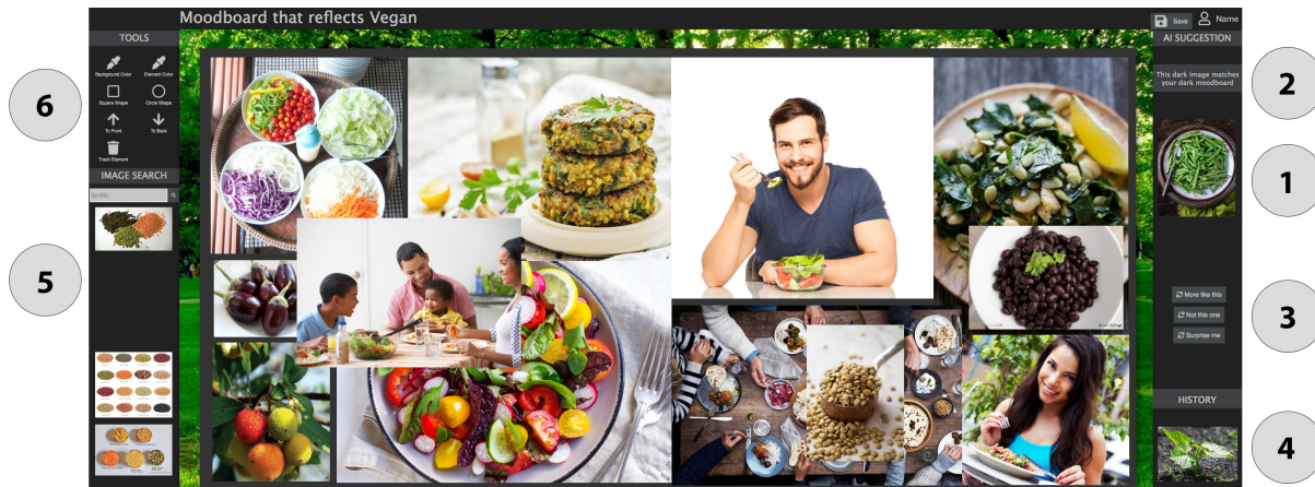
Figure 1: The CCB-based interactive mood board design tool: image suggestion (1), verbal explanation (2), steering controls (3), history panel of previous suggestions (4), image search (5), and editing tools (6).

is an interactive wall display that supports presenting with multimodal and multi-stakeholder feedback.