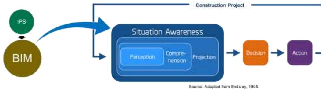
Figure 1: BIM as the Key Interface for Situational Awareness in Construction Projects

This research proposes that the BIM platforms could play a key role in forming situational awareness in construction projects, centralizing the different streams of data and becoming the reliable source of information during construction projects as depicted in Figure 1.