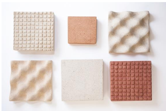
Figure 5. Small material samples and test pieces, sizes 5 x 5 cm and 10 x 10 cm.