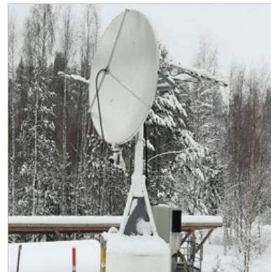
Figure 1 A photograph of MRO-1.8 radiotelescope. Two log-periodic antennae attached to both sides of the dish observe the Sun at the decimeter wavelengths.

Metsähovi MRO-1.8, located at Metsähovi Radio Observatory (MRO), Aalto University (Helsinki Region, Finland, GPS coordinates: N60°13.04', E24°23.35'), is a radio telescope with a 1.8 m dish diameter dedicated for continuous solar observations. The operation frequency range of the radiotelescope is between 10.7 and 11.7 GHz. The front-end of the receiving unit is a low-cost commercial component, a low-noise block down converter (LNB), which converts radio frequency to the intermediate frequency (950-1950 MHz). And finally, the total power of the intermediate frequency band will be sampled and recorded. The telescope's system temperature is higher than 300 K. The full documentation of MRO-1.8 radiotelescope can be found from. 4-6 In Figure 1, MRO-1.8 radiotelescope is shown. MRO-1.8 radiotelescope has been operational since 2001 and it has detected more than a hundred solar radio bursts. 5 Besides studying versatility solar radio burst properties, 5,7 for instance oscillation features have been studied using MRO-1.8 8 .