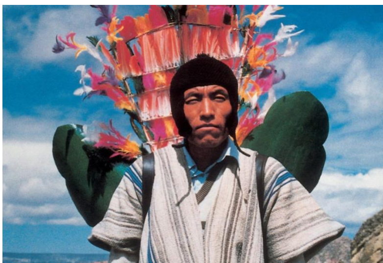
Figure 2: La nación clandestina ( The Secret Nation , Jorge Sanjinés, Ukamau, 1989). Production still.

The idea of film-act developed throughout the clandestine life of La hora de los hornos ( The Hour of the Furnaces , Solanas and Getino, 1968) is seminal for this consideration of experimentality. The overriding performative character of the film, for which Solanas and Getino encouraged rearranging its parts according to the goals of each screening, defined the film as a “pretext for dialogue, for the seeking and finding of wills” (Solanas and Getino, “Towards” 248). This openness was thus a consequence of the quest for specific social dynamics during the projections—seeking the consciousness-raising of the audiences faced with their own colonial history of subjugation—and not an outcome derived from formalist counter-strategies of estrangement. In this way, and despite the nonformalist approach to the idea of open structure, it had a formal impact on the filmic experience and on the film text: intertitles were added to warn audiences, a dialectic between continuity and interruption was constantly at play, projected images and heated discussions were part of the film event, etc. In short, an expanded sense of film form was the consequence of practical and political goals.