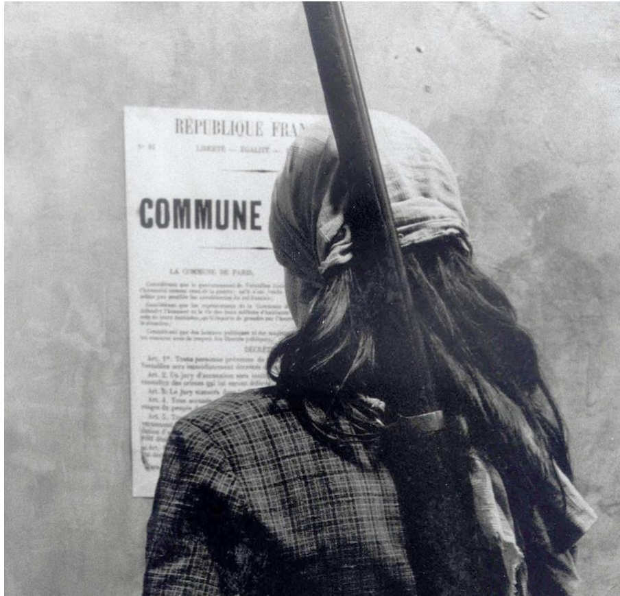
Figure 3: La Commune (Peter Watkins, 2000). Production still.

(Groys 4) where the new must be shaped accordingly to “reintroduc[e] [the whole of] mankind into the world” (Fanon 105).