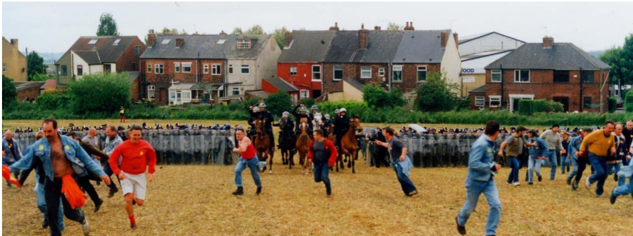
Figure 4: The Battle of Orgreave (Jeremy Deller, 2001). Production Still.

share the common goal of desublimising history through the reactivation of political unrest, by revisiting crucial moments of defeat for the oppressed. If Watkins's film is a thorough exploration of the dialogical dimension of arguably the first proletarian revolution in Europe, the Paris Commune of 1870, which ended with the slaughtering of over thirty thousand Communards (Wayne, "Tragedy" 62), Deller's project explored the clash between miners and policemen that took place in Orgreave in 1984 as one of the most violent episodes of repression against the miners prompted by Thatcher. These two projects engage with an idea of the present as a realm of constant conflict, and of memory of past struggles as the fragmentary locus that may encourage political action in the future. 8 But more importantly, both of them take filmmaking as a research practice that spans in time to give space for more complex and stronger political awareness—for practitioners, collaborators and potential audiences. Filmmaking appears as a social research practice that intervenes, through specific strategies towards history, memory, technology and collective action, in the construction of a diverse, plural, and always-in-dispute public sphere.