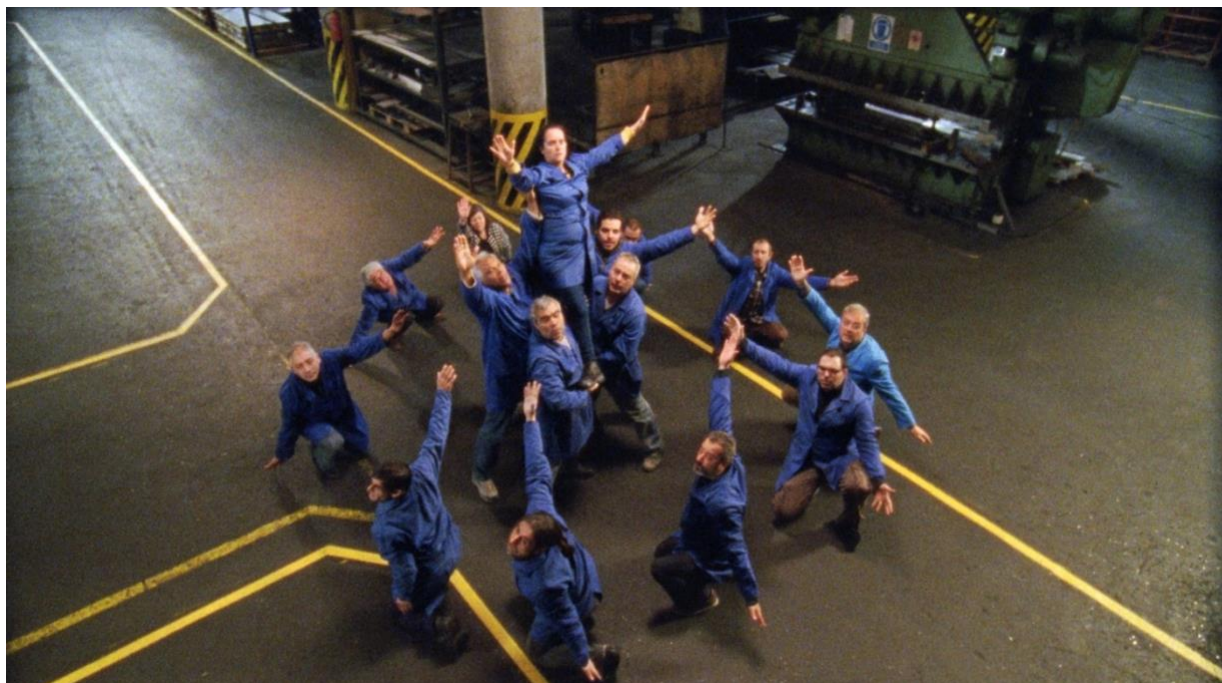
Figure 6: A fábrica de nada ( The Nothing Factory , Pedro Pinho, 2017). Screenshot.