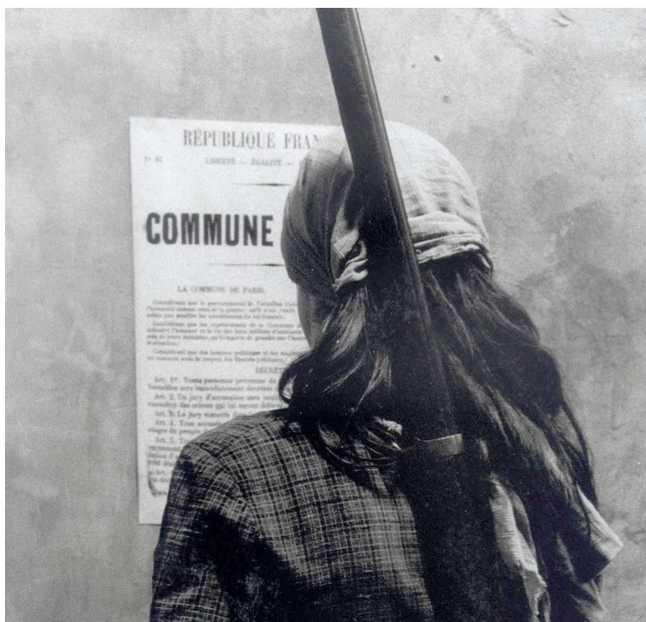
Figure 3: La Commune (Peter Watkins, 2000). Production still.

(Groys 4) where the new must be shaped accordingly to “reintroduc[e] [the whole of] mankind into the world” (Fanon 105).