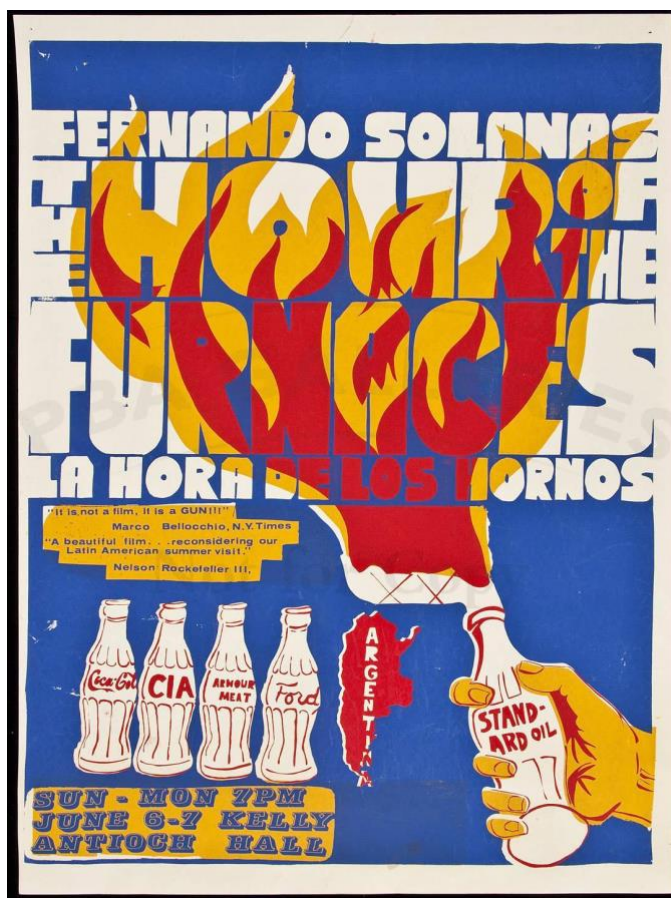
Figure 1: La hora de los hornos ( The Hour of the Furnaces , Fernando Solanas and Octavio Getino, Grupo Cine Liberación, 1968). US Poster.