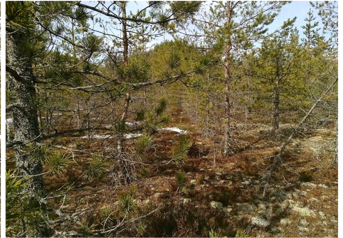
Figure 2 The Tree Mountain in April 2019, photographed from a human perspective. Laura Beloff, 2019.

glance it seems that the romantic, and sometimes mythical, relationship with forest dominates in art. However deeper investigation reveals contemporary artworks and approaches that present perspectives, in which the natural environment is seen as a resource.