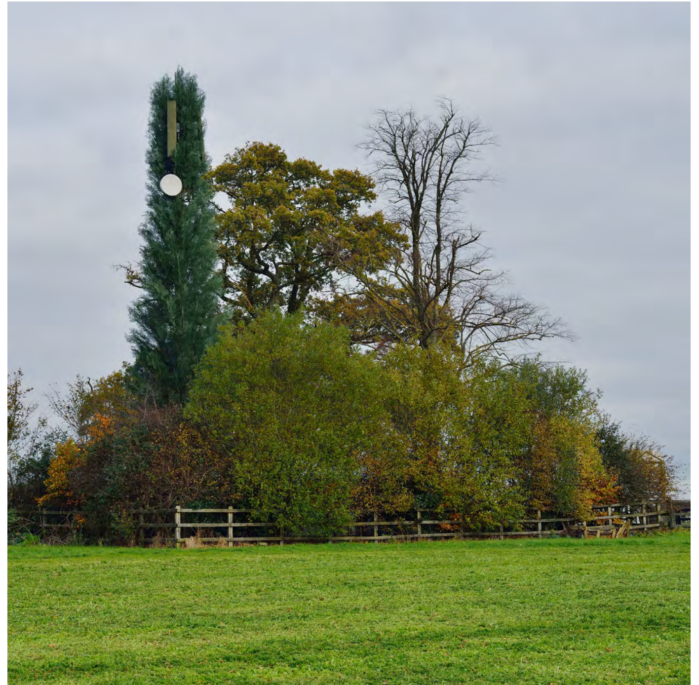
Figure 1 Hear you, can you see me? ( The Baumbeobachter ), Helga Steppan, 2014.