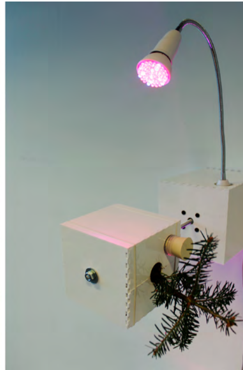
Figure 4 The rotational tests with fir trees and a cloned Danish Christmas tree in a rotation box – a detail of the installation The Condition (2016) by Beloff & Joergensen.