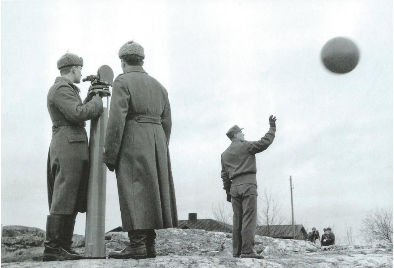
The launch of a weather balloon at the Vallisaari military meteorological station in 1962. According to Enqvist and Eskola, the task of the centre was to train conscripts as well as regular persons in the skills of meteorology.

in 1917. Weapons and explosives were stored by the Finnish Defence Forces on Vallisaari until recently. In addition, a residential community of 300 residents flourished in the 1950s. In the years following, the military reduced its operations on the island and, in 2008, the Finnish Defence Forces announced their departure from the island. Subsequently, in 2013, National Parks Finland initiated a project to prepare the opening of the islands to visitors. Vallisaari was finally opened to the public in 2016, as a wilderness among the cannons.