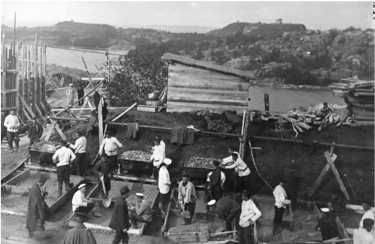
The construction of a battery in progress on the island of Kuninkaansaari in 1900. According to Enqvist and Eskola, the increased tension before the Crimean War (1854–1856) resulted in the construction of a chain of batteries on Vallisaari and Kuninkaansaari in 1853. The work continued throughout the rest of the nineteenth century, with earthen batteries gradually substituted by stone and concrete batteries. These derelict ramparts are today fertile grounds for a rich biodiversity of plants and animal species.

The history of Vallisaari is replete with natural and infrastructural entanglements. In between military occupations and abandonments, the island was transformed into an ecological paradise, but is now to be drawn back into the sphere of infrastructure through cultural and touristic development. Its transformations—whether for the worse or the better—have depended on regional geopolitics, location, and natural geography. When one traces this history, one finds an intermittent occupation of the environment by military structures, followed by abandonment, and subsequent recovery. Forthcoming international art events such as the Helsinki Biennial, inherently needing water, data, and energy to sustain them, also operationalize the island into infrastructure. Studying these natural and infrastructural transformations will be useful for any comprehensive study in the future to map the complex environmental history of Vallisaari.