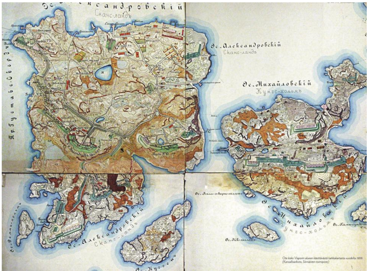
Map of Vallisaari (left) and Kuninkaansaari (right) from 1899, showing the various military buildings, housing, ammunition storages, and batteries. Most of these structures are today in ruins taken over by the wilderness.

By the beginning of the twentieth century the island of Vallisaari in the Helsinki archipelago was left bombed, cratered, and barren by the various multi-national militaries of the region. However, with the gradual abandonment of the island, wilderness took over, bringing with it a rich diversity of plants, animal species, and habitats. Today, infrastructural works to support cultural and touristic development, as well as to host an international arts biennial, threaten to change Vallisaari's landscape and ecosystem.