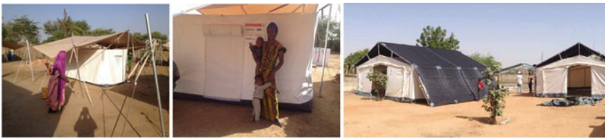
Fig. 4 S(P)EEDKITS field test in Ntiagar, Senegal, December 2015

On December 2015, partners shipped 10 cocoons to Senegal for a field test in Ntiagar, a village close to Dakar that is inhabited by Ronkh community (Fig. 4).