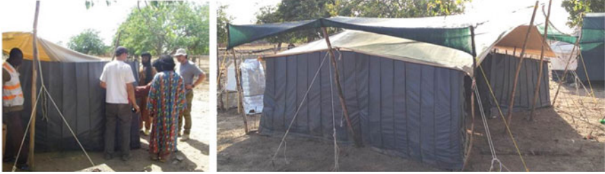
Fig. 3 S(P)EEDKITS field test in Sanioniogo, Burkina Faso, November 2013

or to collect a large amount of filling material. Therefore, it was not possible to fill the panel without inserting structural elements into its small cells. After positioning the Textile wall along a covered area of 15 m 2 , locally available dried eucalyptus poles were used to prepare two frames made with horizontal and vertical elements crossing each other every 1 m approx. Connections were fixed with ropes. This first prototype erected in Sanioniogo has been shown during the MILIPOL, the annual exhibition about safety and risks, held in Paris from 17th to 20th November 2013, achieving a good evaluation from NGOs and field operators.