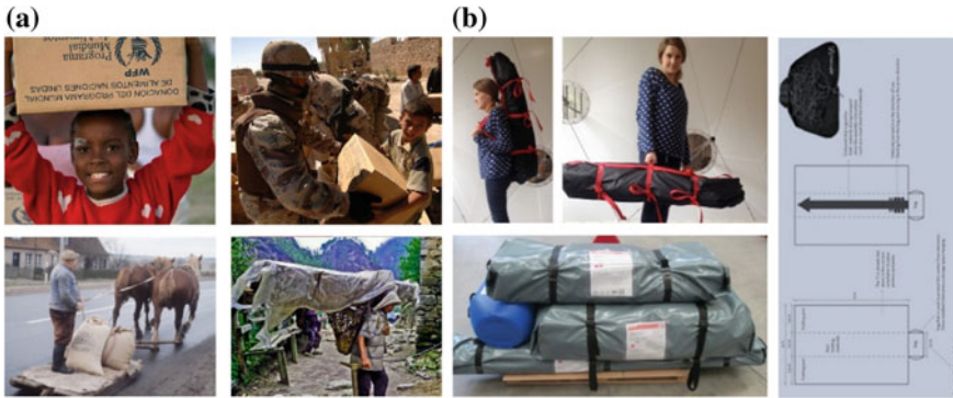
Fig. 2 a Current packaging in emergency field, b S(P)EEDKITS basic bag concept

In order to list profitable examples and inspiring solutions that can be transfer from other sectors to the emergency field, special attention was done to the following design principles, thus qualifying the state of art as a systemic catalogue of multipurpose concepts: (i) the rhizomes as system of systems; (ii) the nesting as an optimizing process; (iii) the identity and information layer; (iv) the handling as the key strategy for new smart packs made of textiles. Taking into account these design principles, POLIMI worked on a novel packaging concept (“basic bag”), used for WP2 shelter kits, and on the optimization strategies that all the partner—involved in the consortium as kit developers—needed to apply. Strategies were targeted at maximizing occupation, managing modular composition of items in the load, reducing voids and minimizing handling (Fig. 2).