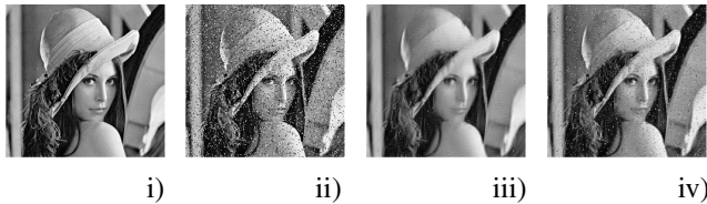
Fig. 2. i) Original Image. ii) Noisy image. iii) Reconstructed image ( K = 6 ). iv) Reconstructed image ( K = 10 ).

used. The difference between the two obtained results highlight that there is a compromise between sparsity to reduce noise and loss of details in the original image.