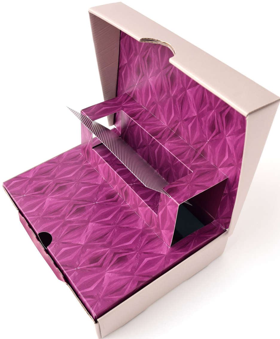
Figure 2 E-commerce package.