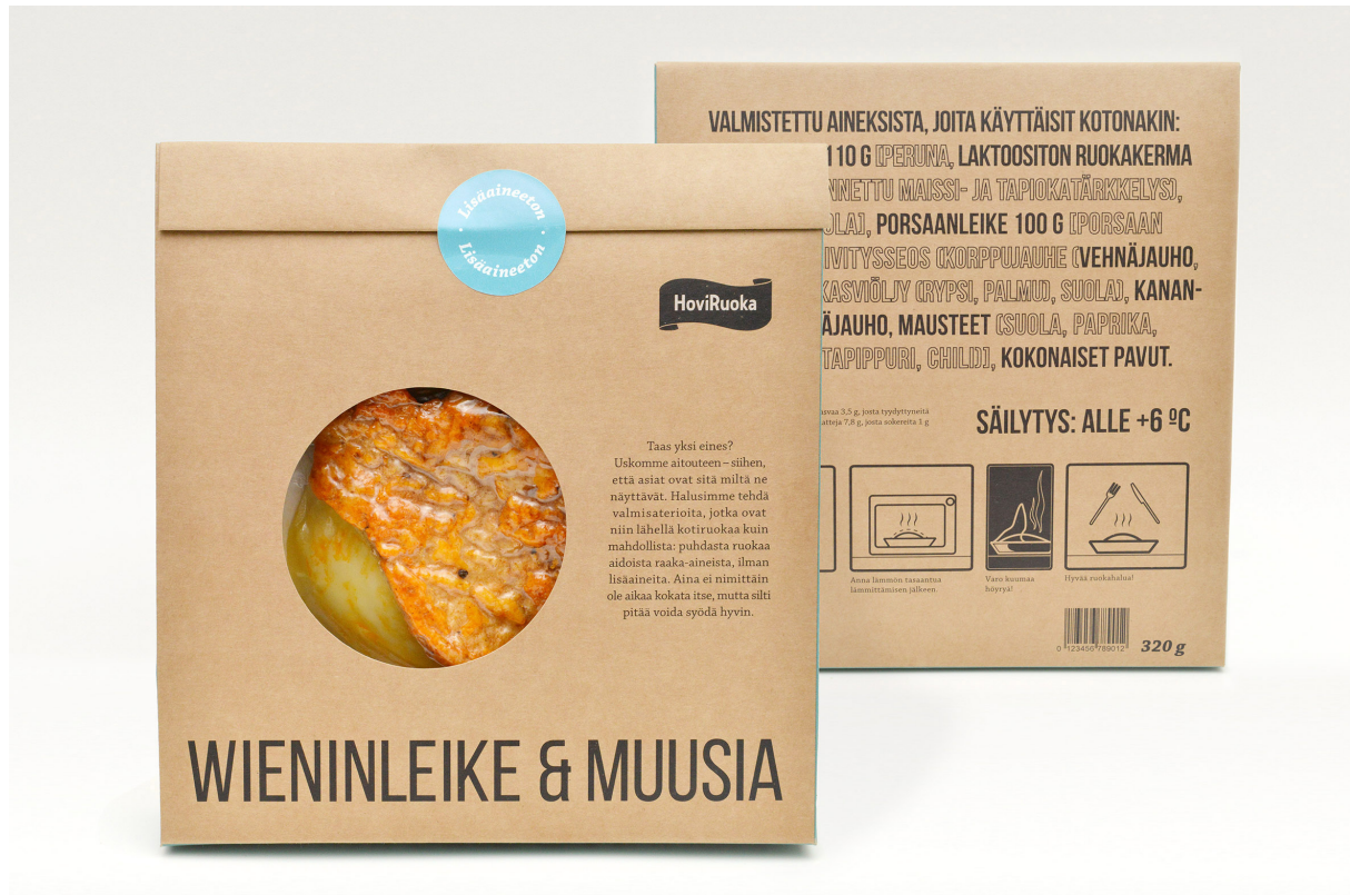
Figure 3 Ready meal package.