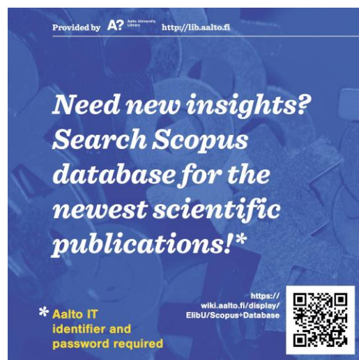
Figure 4 QR code poster leading to a single resource.

What follows is an examination Aalto University Library's digital portals elements of UX. Figure 4 presents a QR code poster used within the Aalto University Learning Hubs.