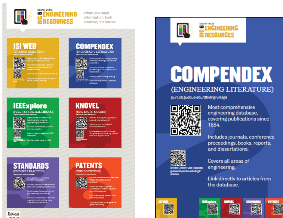
Figure 5: Big 6 QR poster linking to mobile portal of Purdue resources (on left) and poster, focusing on one of the Big 6 topical areas (on right).

Two main styles of users are addressed in this design, the quick searcher who is looking for some information immediately, and who has little bandwidth on their mobile device in which to view resources they find. The other is a researcher who has a deeper, long-term need for information and is willing to find out more about the resources available. They might read about the resources and do a more in-depth search later on a device that can accommodate more information on a screen (e.g., on a desktop or laptop computer).