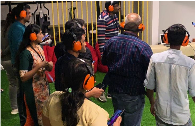
Figure 2. Participants experiencing the noise-canceller condition using a noise-cancelling headgear.

3M noise-cancelling headgears with additional earplugs were distributed among the participants. After reading the scenario, the participants were asked to put on the earplugs and the noise cancelling headgear to simulate hearing impairment. The simulated scenario as described above commenced as soon as all participants were in their simulation for direct hearing impairment gear. Figure 2 shares a scenario from the Noise-canceller condition.