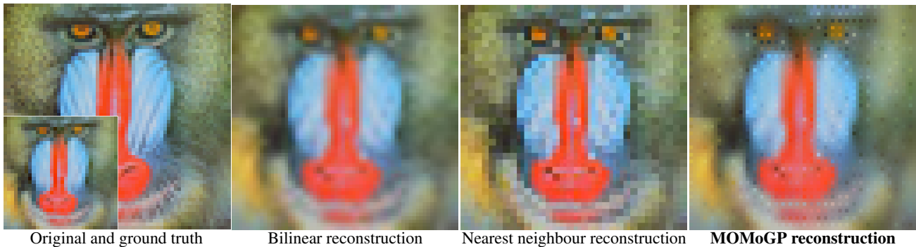
Figure 3: Image upsampling using MOMoGP and other methods. MOMoGP obtains the best reconstruction with an RMSE of 1.289, while Bilinear has RMSE of 1.542 and Nearest neighbour of 1.855. (Best viewed in color)

location of the pixel to be interpolated. In this experiment, the original image has the size of 64 \times 64 and was downsampled to 32 \times 32 . We then aim to reconstruct the original image from the downsampled version. For MOMoGP, we set K_S = 2 , K_{P_x} = 2 , K_{P_y} = 2 and M = 256 . As visualized in Fig. 3, bilinear interpolation produces smooth and blurry artefacts. The nearest neighbour approach brings blocks in the image. MOMoGP as an interpolation approach achieves the best performance, exhibiting a more appropriate balance between colour flattening and salient edge.