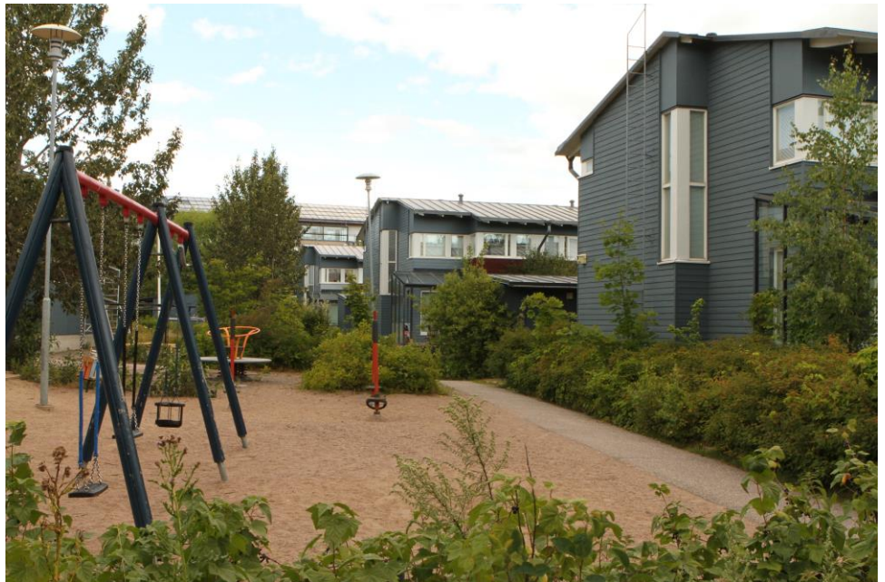
Figure 1. Wooden houses in Viikki eco-district in Helsinki.

basis to a performance-based design basis (Ramage, et al., 2017). For example, in Finland, changes in fire regulations have allowed the use of wood in building frames and façades up to four storeys since 1997, and up to eight storeys since 2011 under standardized conditions (Puuinfo, 2018b), while the eight-storey limit does not apply in the case of individual fire performance analysis. Furthermore, the increasing use of wood in buildings may be encouraged by new environmental policies for the built environment. For example, some cities with carbon neutrality objectives (e.g. Copenhagen, Helsinki, Seattle and Vancouver) support the use of wood as a building material or as fuel. Helsinki municipality has recently made the use of wood materials in the new buildings of Honkasuo district mandatory. This decision was legitimized by the Finnish Supreme Court in 2015 based on the Land Use and Building Act 132/1999 of the Ministry of the Environment, which allows municipalities to supervise and approve plans and projects, including the possibility to introduce design constraints (e.g. the use of specific materials) in urban regulations (Franzini, et al., 2018). However, to underpin the role of wood products in sustainable buildings, there is a need to increase debate (amongst stakeholders) so as to inform future practices and policies in the building sector.