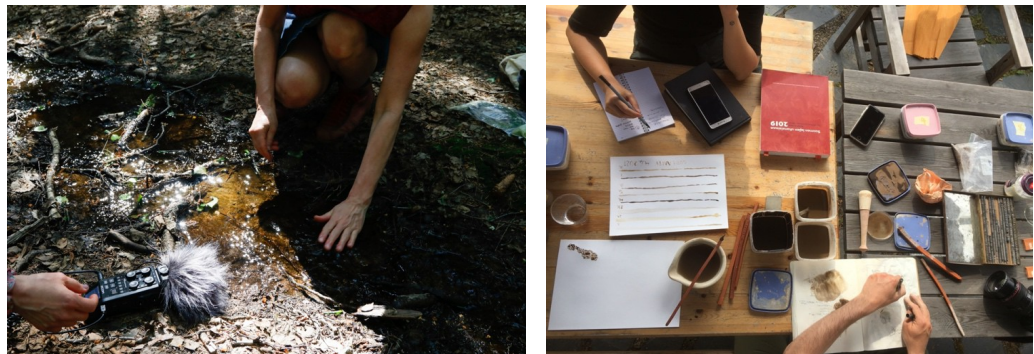
FIGURE 12. Exploring soil in Nuuksio National Park in Espoo. FIGURE 13. Ceramists and sound artists experimenting with processed Espoo soils together.

Design researchers Adam Thorpe and Lorraine Gamman (2021, 249-250) point out that Arendt's idea of power includes both power as a process and power as a product (speech and action). In both cases, power is coactive. Power emerges with people in proximity and plurality, thus highlighting individuals that act together for a common purpose. However, institutional power can also be experienced as a coercive power, power over people (ibid.). This is true also with art institutions such as museums. Through their authority, museums can affect how craft and design are understood (Zetterlund 2013, 49). In the three projects, however, we used institutional power to increase the visibility of our actions. Hence, it was coactive power. The first project was established in the Research Pavilion, in the setting of the Venice Biennale; The second project took place in one of Finland's national museums, The Design Museum Helsinki; The third project is set in another highly valued art institution, the Espoo Museum of Modern Art EMMA. Consequently, we are aware that the participation of environmental institutions such as the Finnish Environment Institute SYKE and the Geological Survey of Finland not only enables practical engagement with the research tasks but also increases credibility in conducting interdisciplinary research. This also applies to the affiliated academic institution, Aalto University, with its multidisciplinary affluence.