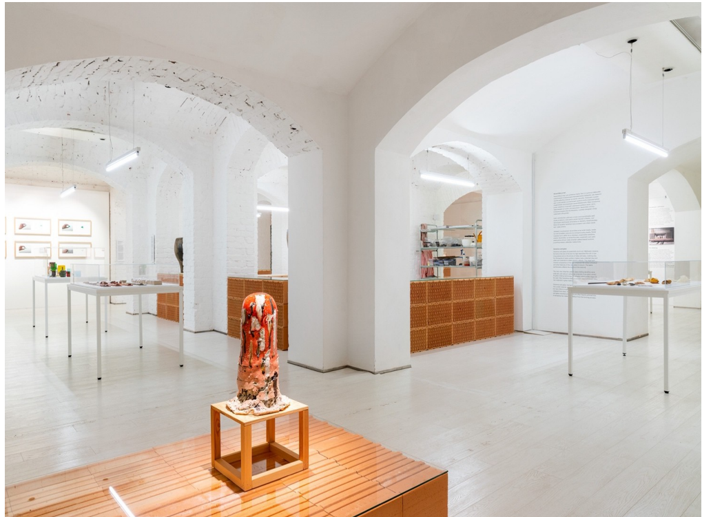
FIGURE 5. General view of the Soil Matters exhibition.

One of the nine projects was Soil Laboratory 8 belonging to the third category of caring for soils together. It was set at the heart of the exhibition. Following the idea of the Earth Laboratory , Soil Laboratory , too, consisted of several activities that were designed to open the creative research processes to the public (Latva-Somppi, in press). One element was an open studio, where the Working with Soil group conducted their creative work. During the exhibition, three interlocking projects evolved in the laboratory: 1) One of the exhibition's projects, Un/making Soil Communities extended to the areas of the local glass industry in Nuutajärvi (Latva-Somppi et al. 2021, 2) Critically Endangered Species drew attention to the other-than-human species who are dependent on the wellbeing of soil, and 3) Soil Stories invited the audience to send in soil samples they had collected themselves.