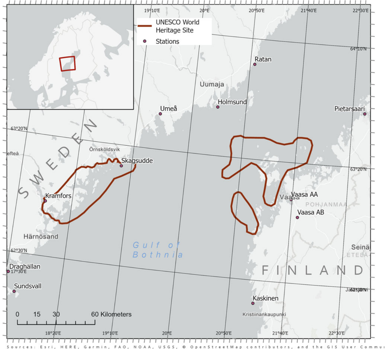
Fig. 1 The UNESCO World Heritage Site of Kvarken and High Coast in Northern Europe together with the geodetic observation points of the area

ties that are of interest for our study. Firstly, the NKG2016LU land uplift model (Vestøl et al. 2019) that was computed in co-operation in the Working Groups for Geodynamics and for Geoid and Height Systems. Secondly, the absolute gravity measurements that are discussed and published in co-operation in the Working Group of Geodynamics (e.g. Olsson et al. 2019). And thirdly, the NKG Analysis Centres, under the Working Group for the Reference Frames, which continuously process the GNSS data from the permanent GNSS stations (Lahtinen et al. 2018).