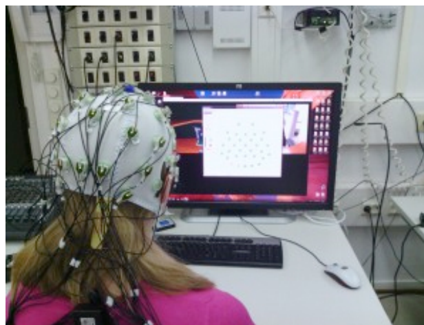
Figure 1. EEG equipment used in research on skill learning.

Figure 1 shows the research setting of the skill learning experiment. EEG measurements were performed before and after learning a specific textile craft skill. Electrodes were placed at various locations on participants' scalps to measure the voltage of synchronous electrical activity of neurons at those locations. During measurements, participants' brain responses were recorded using a NeurOne EEG-instrument (Mega Electronics Ltd, Finland) with 32 EEG and EOG channels. The EEG procedure enables illustrating brain activity during real-time viewing and action and is non-invasive and much less cumbersome than other brain imaging systems.