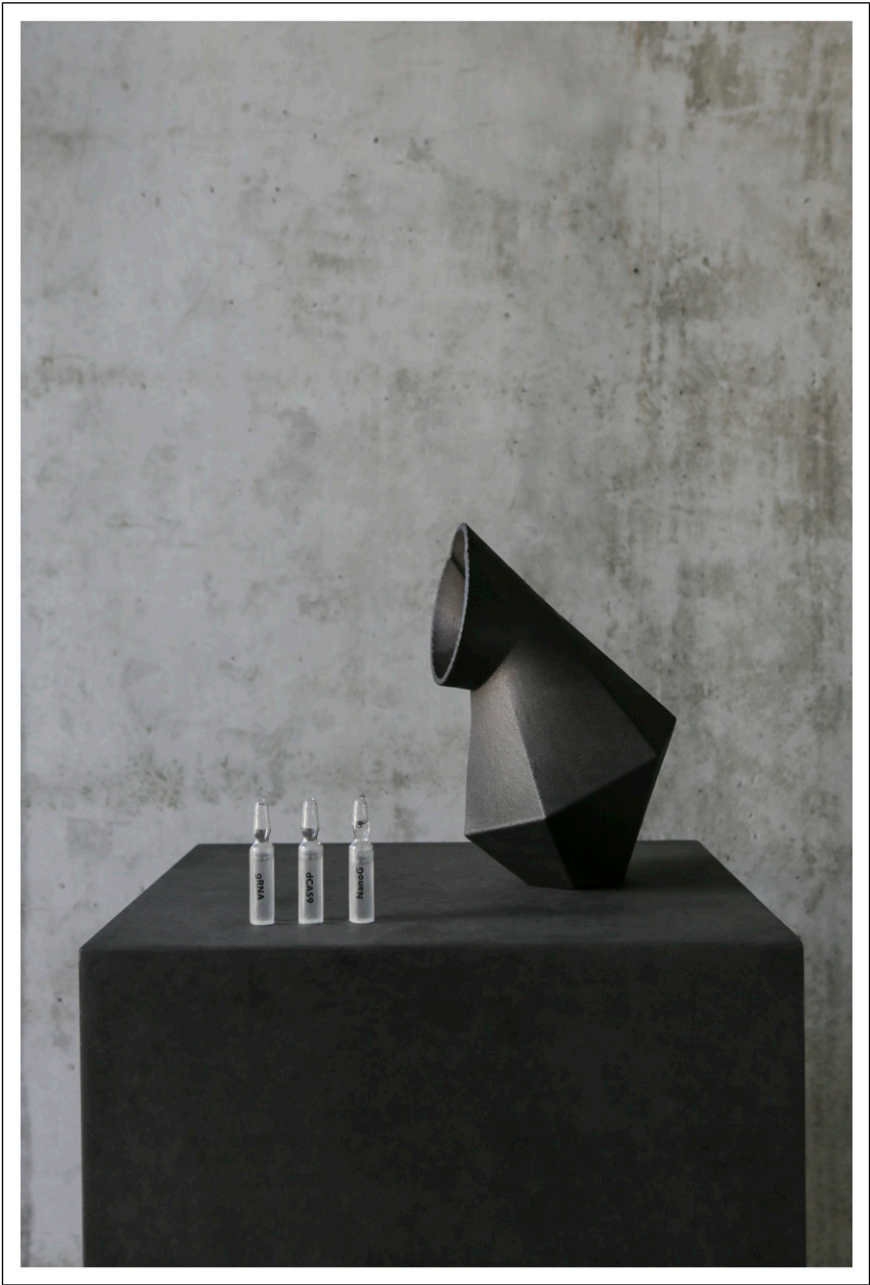
Figure 1. A speculative rejuvenation device for daily use.